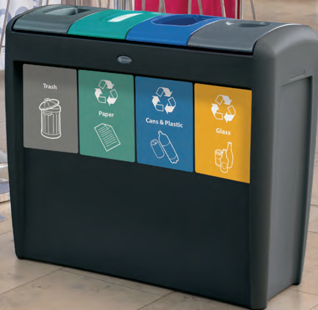
NEW Nexus® Transform 26G Quad Recycling Bin