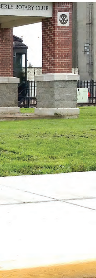
Glasdon Jubilee™ 29G Trash Can