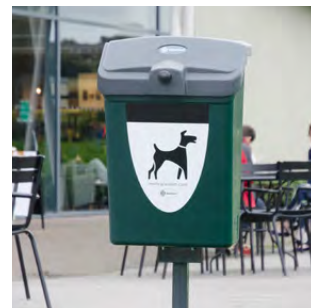
Fido™ Pet Waste Station