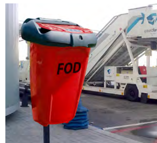
FOD Bin 13G