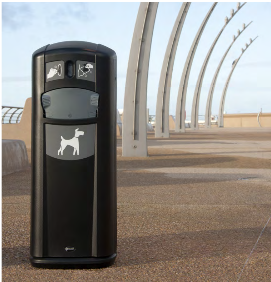
Retriever City™ Pet Waste Station