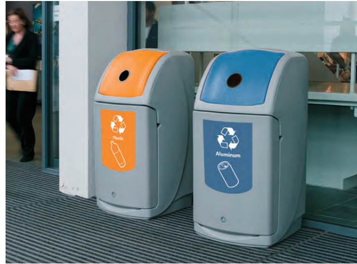
Nexus® 36G Recycling Bin