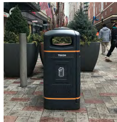
Glasdon Jubilee™ 29G Trash Can