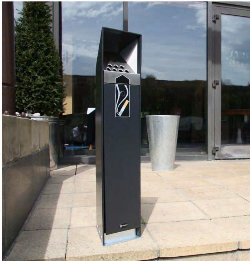
Ashguard™ Cigarette Unit