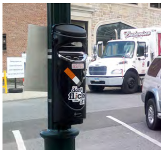
Ashmount SG™ Cigarette Unit