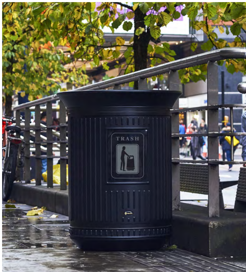
Canyon™ Trash Can