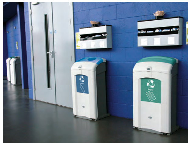
Nexus® 26G Recycling Bin