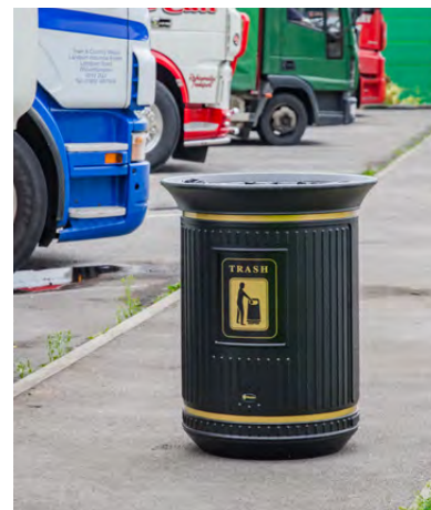
Canyon™ Trash Can