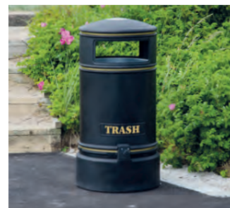
Topsy Jubilee™ Trash Can