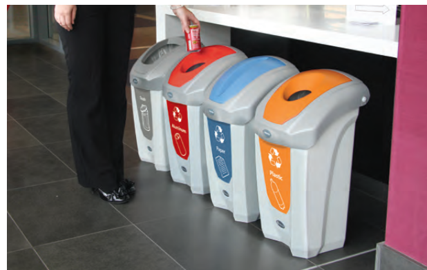
Nexus® 8G Recycling Bin