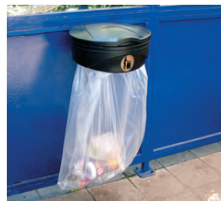
Glasdon Orbit™ Bag Holder