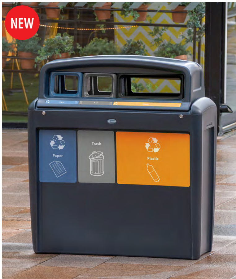
NEW Nexus® Transform City Trio Recycling Station