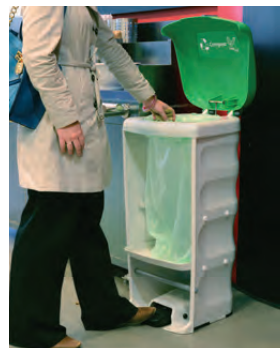
Nexus® Shuttle Recycling Bin

Our Food Waste Recycling Bins are ideal for kitchens, canteens, food courts and any other areas where food is prepared or consumed. The easy to use bins make food waste disposal hygienic and efficient and they are a good way of handling high volumes of food waste.