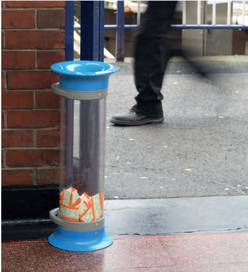
C-Thru™ 10Q Recycling Bin