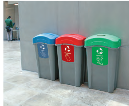
Eco Nexus® 16G Recycling Bin