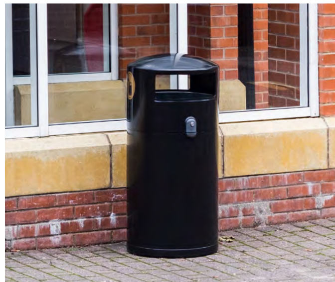
Community™ Trash Can