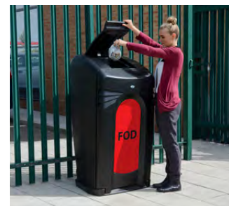
FOD Bin 64G