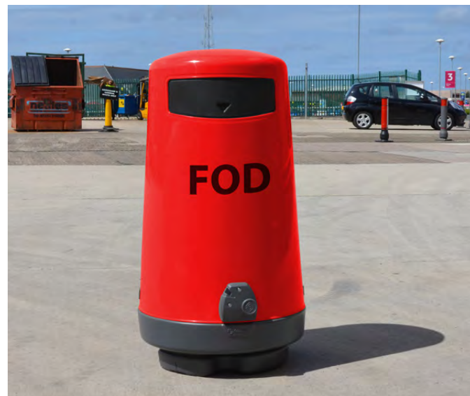
FOD Bin 23G