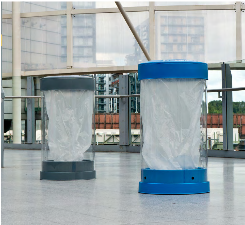
C-Thru™ 50G Recycling Bin

Our indoor recycling bins are available in a variety of styles, streams and capacities to make creating a recycling station as easy as possible. Many of our customers choose to personalize their products with their logo, colors and slogans. We can even customize your recycling bins to create bespoke waste streams to suit your recycling program.