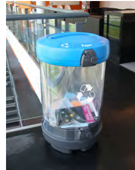
C-Thru™ 48G Recycling Bin