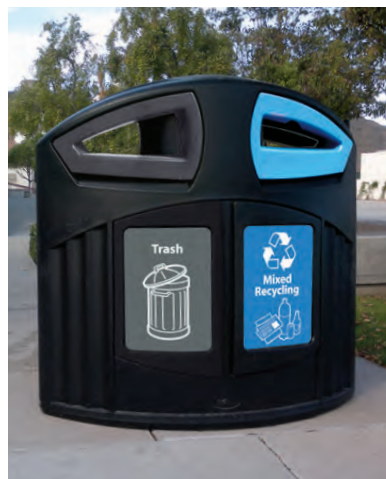
Nexus® 52G Dual Trash Recycling Bin