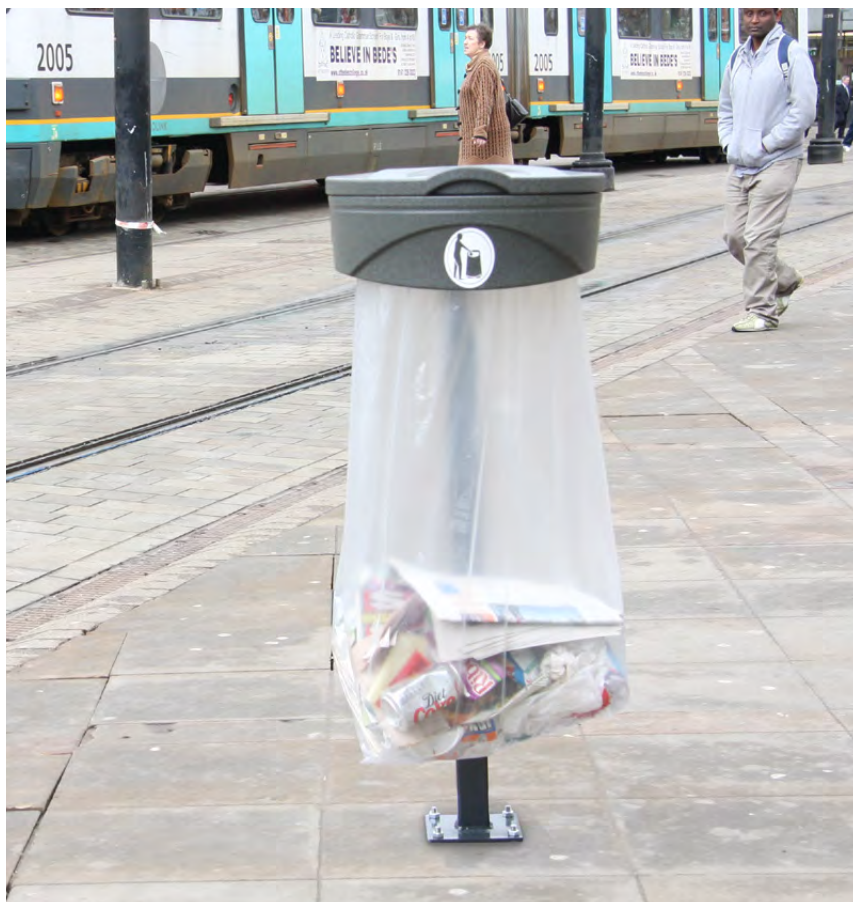
Glasdon Orbit™ Bag Holder