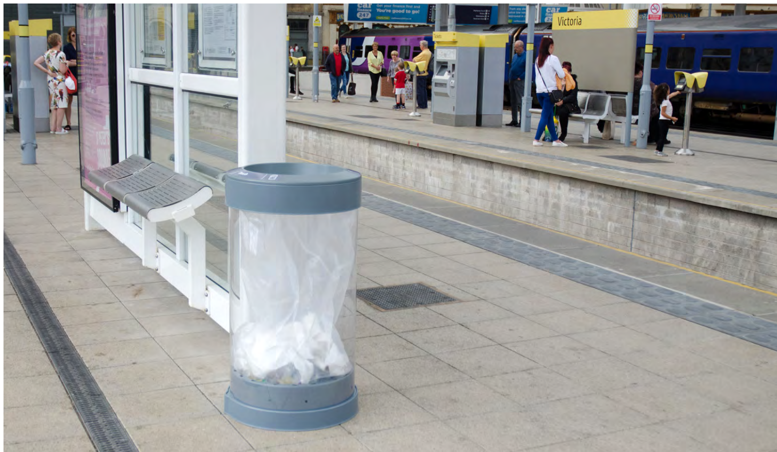
C-Thru™ 50G Trash Can