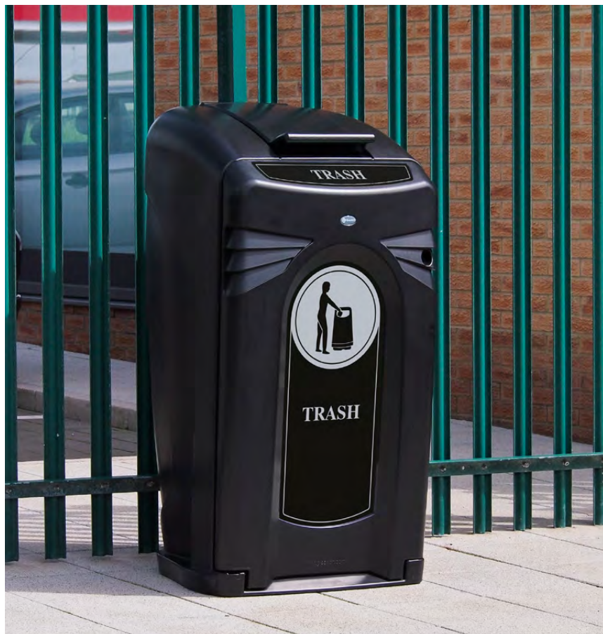
Nexus® City 64G Trash Can