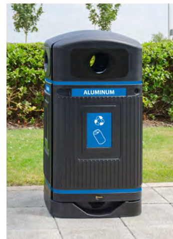
Glasdon Jubilee™ 29G Recycling Bin