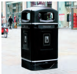
Glasdon Jubilee™ Trash Can with Ashtray Option