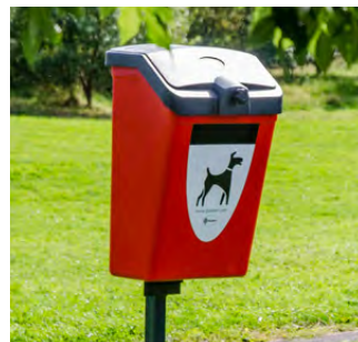
Fido™ Pet Waste Station

Our selection of pet waste stations are popular for use in parks, on sidewalks and in bark parks. The clear decals help to encourage people to dispose of their dog poop correctly and the contemporary design of our dog waste units means that they complement existing landscapes easily.