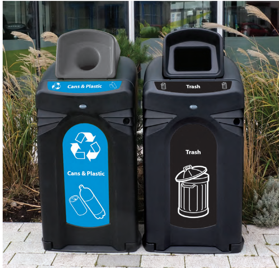
Nexus® City 64G Recycling Bin

We supply an extensive range of outdoor recycling containers, ideal for collecting various waste streams in exterior environments. The resilience and durability of our outdoor recycling bins means that they are able to withstand adverse weather conditions as well as being corrosion, rust and chip resistant.