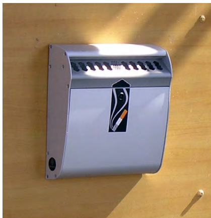
Ashmount™ Cigarette Unit