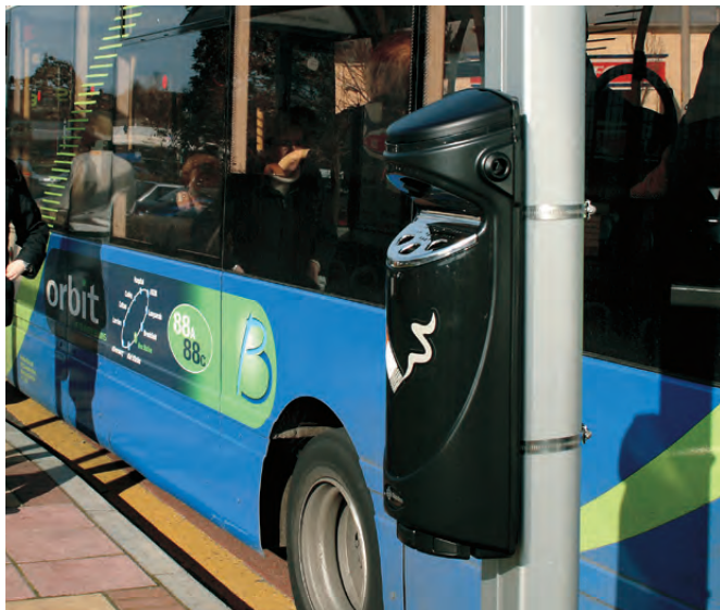
Ashmount SG™ Cigarette Unit