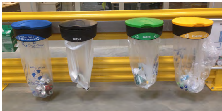
Glasdon Orbit™ Recycling Bag Holder