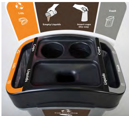
NEW Eco Nexus® Cup Recycling Station