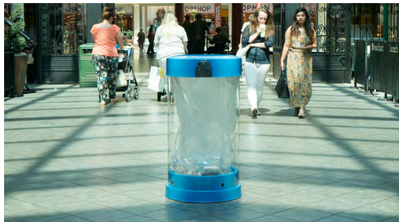
C-Thru™ 50G Recycling Bin