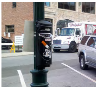
Ashmount SG™ Cigarette Unit