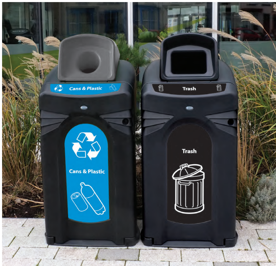
Nexus® City 64G Recycling Bin

We supply an extensive range of outdoor recycling containers, ideal for collecting various waste streams in exterior environments. The resilience and durability of our outdoor recycling bins means that they are able to withstand adverse weather conditions as well as being corrosion, rust and chip resistant.