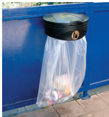
Glasdon Orbit™ Bag Holder