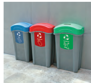
Eco Nexus® 23G Recycling Bin