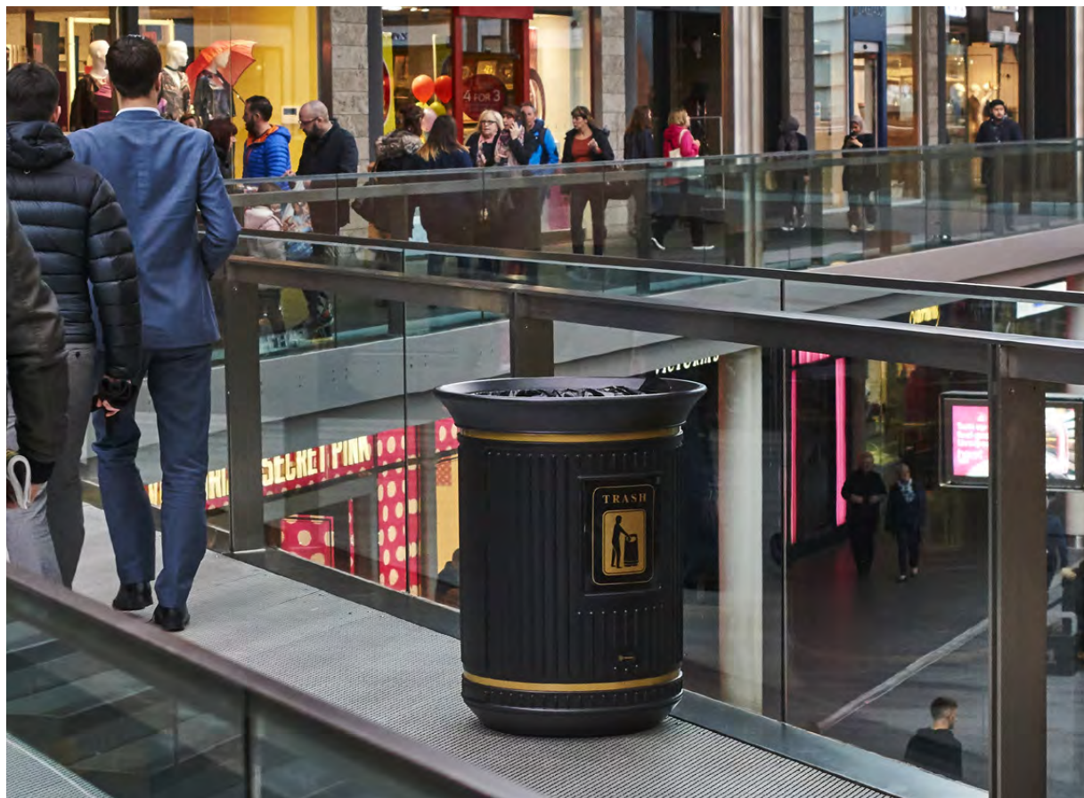
Canyon™ Trash Can