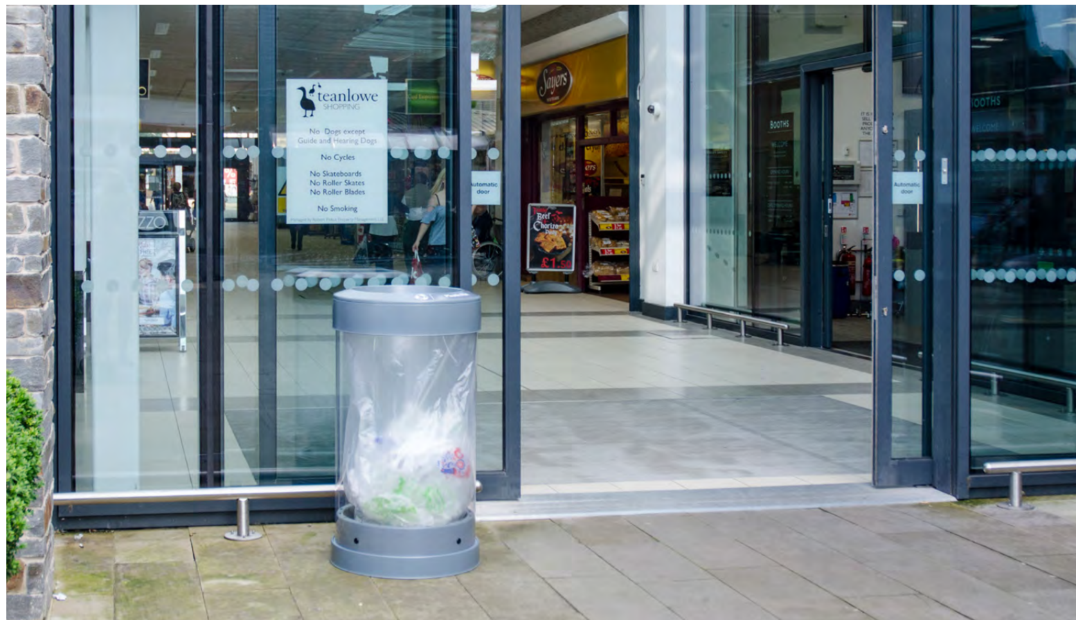
C-Thru™ 50G Trash Can