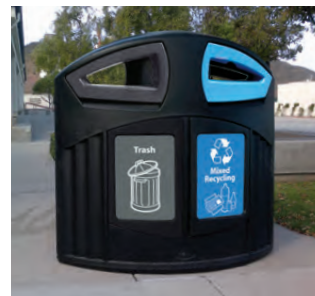
Nexus® 52G Dual Trash Recycling Bin