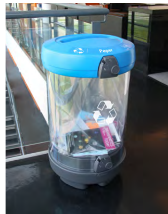
C-Thru™ 48G Recycling Bin