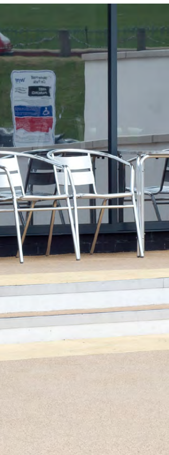
Glasdon Jubilee™ 29G Trash Can