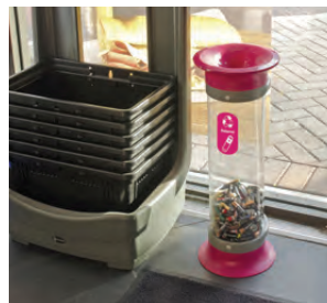
C-Thru™ 10Q Battery Recycling Bin