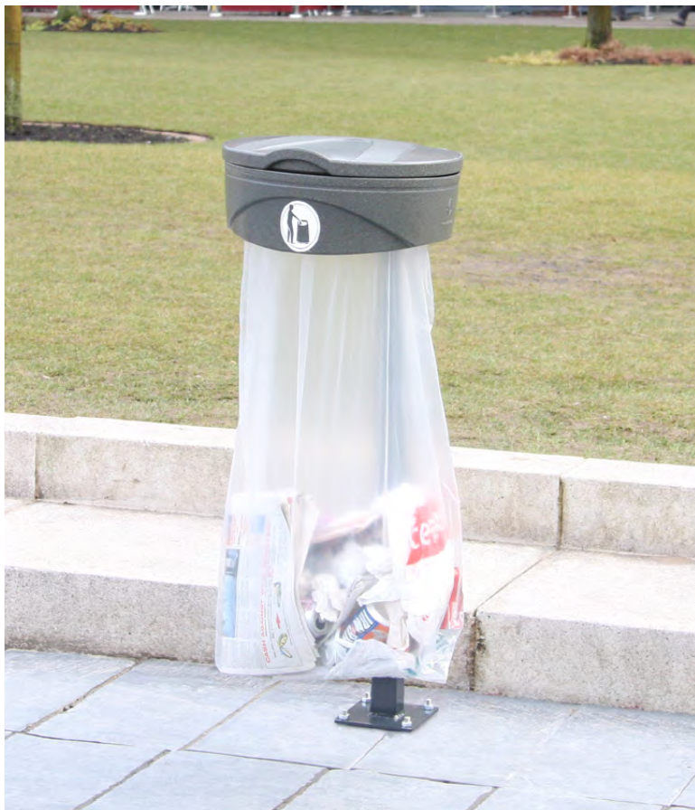
Glasdon Orbit™ Bag Holder