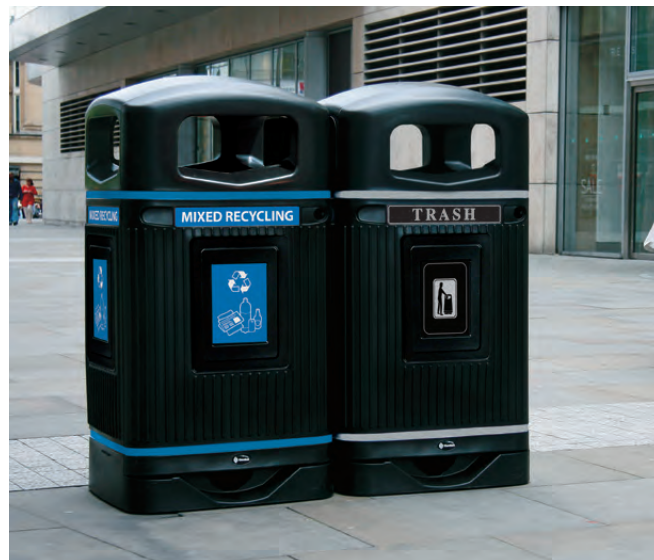
Glasdon Jubilee™ 29G Recycling Bin