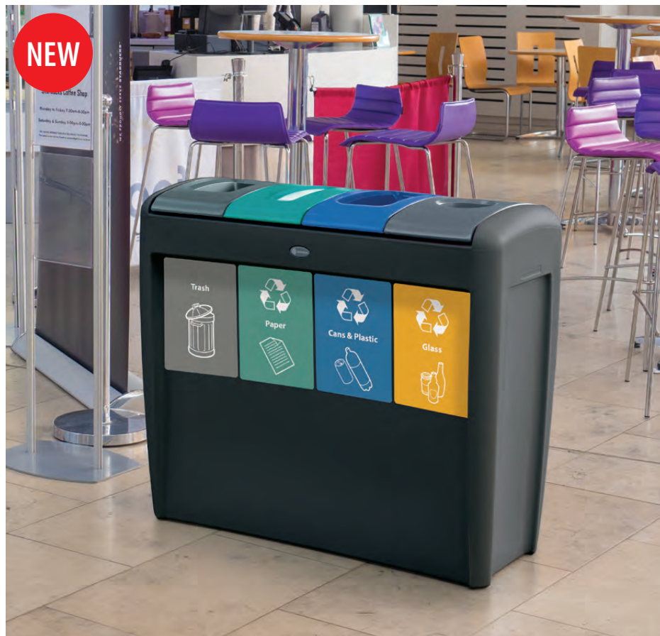
NEW Nexus® Transform 26G Quad Recycling Bin

Our indoor recycling bins are available in a variety of styles, streams and capacities to make creating a recycling station as easy as possible. Many of our customers choose to personalize their products with their logo, colors and slogans. We can even customize your recycling bins to create bespoke waste streams to suit your recycling program.