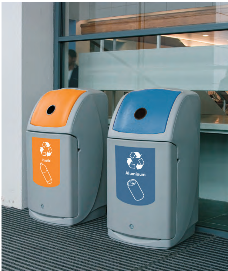
Nexus® 36G Recycling Bin