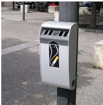
Mini Ashmount™ Cigarette Unit

Within our range of cigarette waste containers there are units that can be wall mounted as well as free standing. Having a cigarette unit mounted to a wall takes up very little space making it perfect for narrow footed areas. Help to reduce the cost of cleaning up cigarette butt litter for your organization by installing a cigarette ash receptacle.