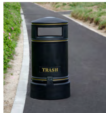
Topsy Jubilee™ Trash Can