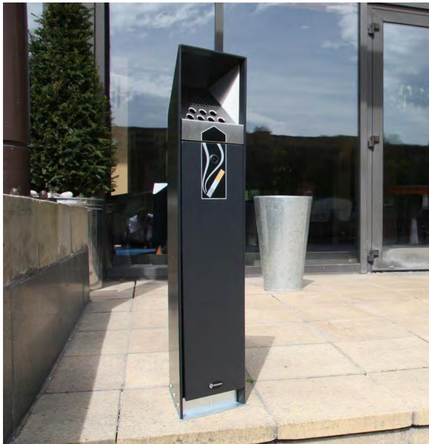
Ashguard™ Cigarette Unit