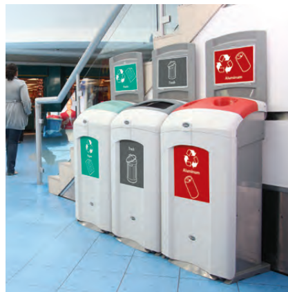
Nexus® 26G Recycling Bin