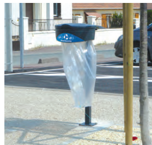
Glasdon Orbit™ Recycling Bag Holder