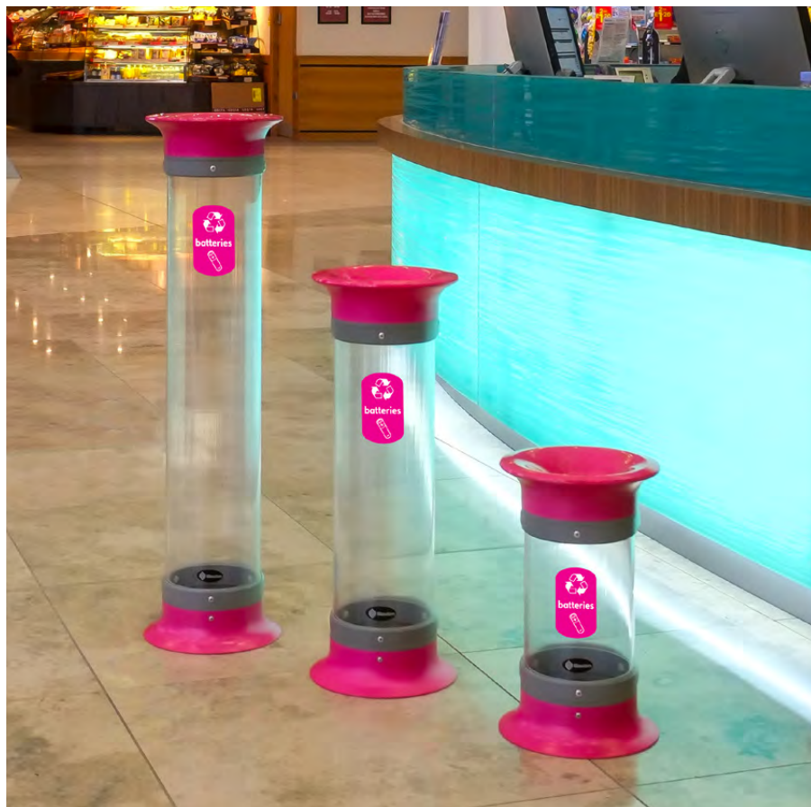
C-Thru™ 5, 10 and 15Q Battery Recycling Bin