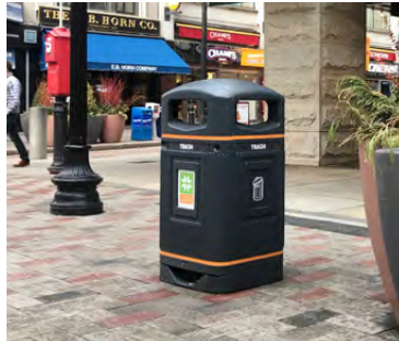
Glasdon Jubilee™ 29G Trash Can