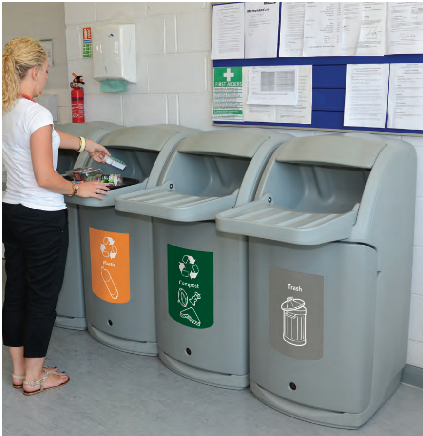
Nexus® 36G Recycling Container