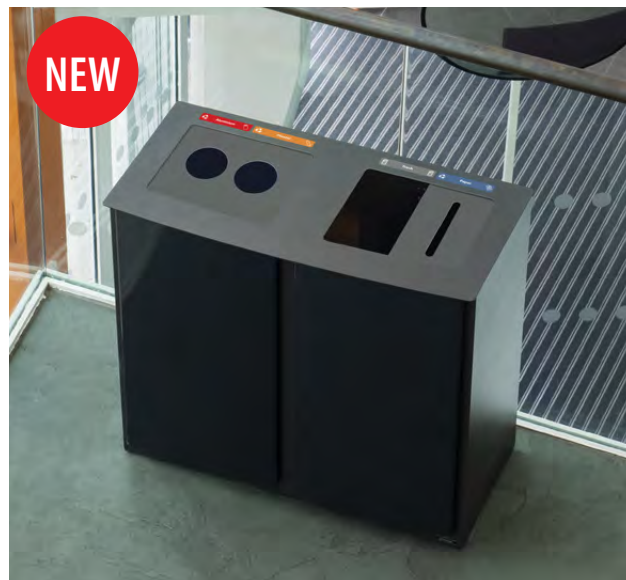
NEW Nexus® Style 48G Quad Recycling Station