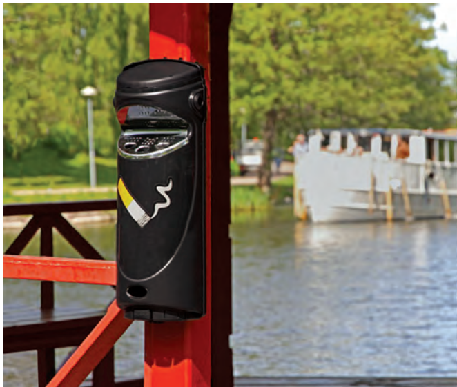
Ashmount SG™ Cigarette Unit