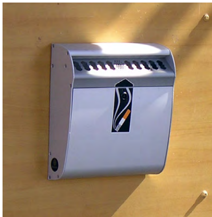
Ashmount™ Cigarette Unit