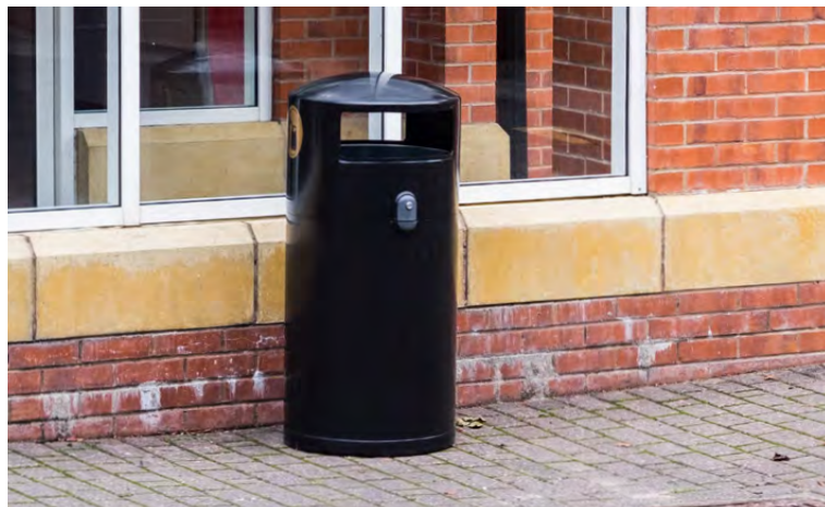
Community™ Trash Can