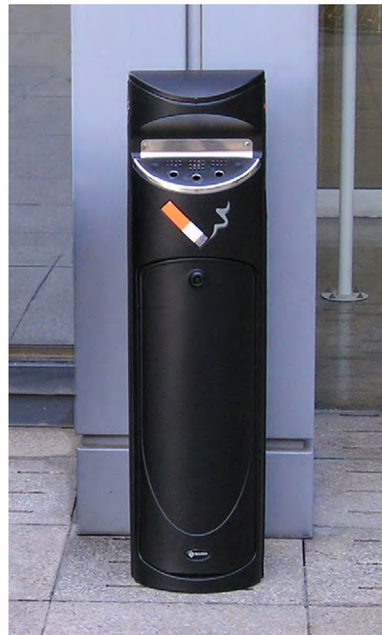
Ashguard SG™ Cigarette Unit