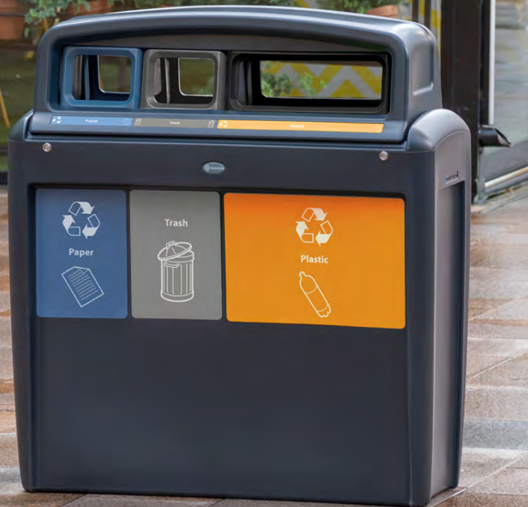
NEW Nexus® Transform City Trio Recycling Station