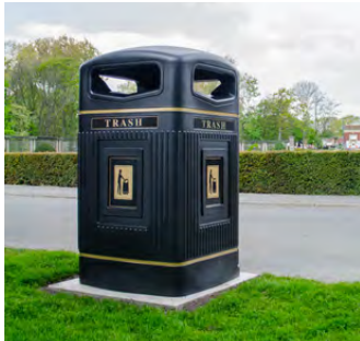
Glasdon Jubilee™ 80G Trash Can

The Glasdon range of trash cans are available in a choice of sizes, colors and styles, providing waste management solutions that will complement any location. Constructed from durable materials, these trash cans are designed to resist the effects of adverse weather conditions, corrosion and vandalism.