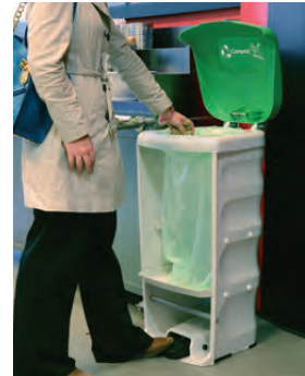
Nexus® Shuttle Recycling Bin

Our Food Waste Recycling Bins are ideal for kitchens, cafeterias, food courts and any other areas where food is prepared or consumed. The easy to use bins make food waste disposal hygienic and efficient and they are a good way of handling high volumes of food waste.