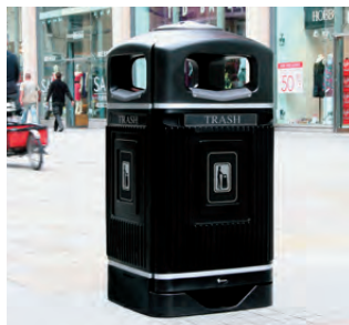
Glasdon Jubilee™ Trash Can with Ashtray Option