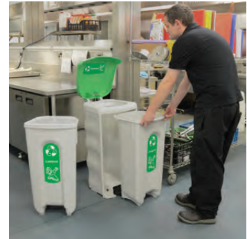
Nexus® Shuttle Recycling Bin