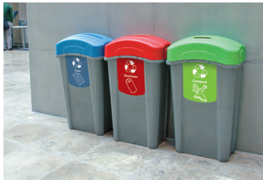
Eco Nexus® 23G Recycling Bin