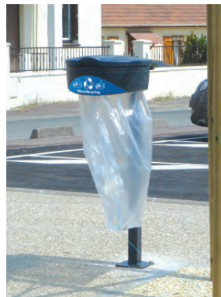
Glasdon Orbit™ Recycling Bag Holder