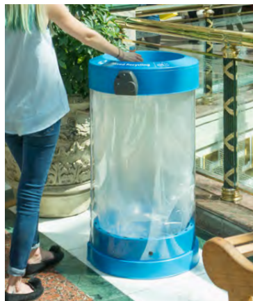
C-Thru™ 50G Recycling Bin

We supply an extensive range of indoor recycling containers suitable for various internal environments. Our range of cup recycling bins are ideal for promoting the responsible disposal of discarded cups. A selection of our recycling bins also feature a liquid reservoir to help users dispose of any coffee or liquid remains.