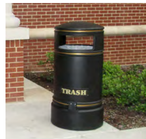
Topsy Jubilee™ Trash Can