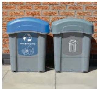
Eco Nexus® 16G Recycling Bin