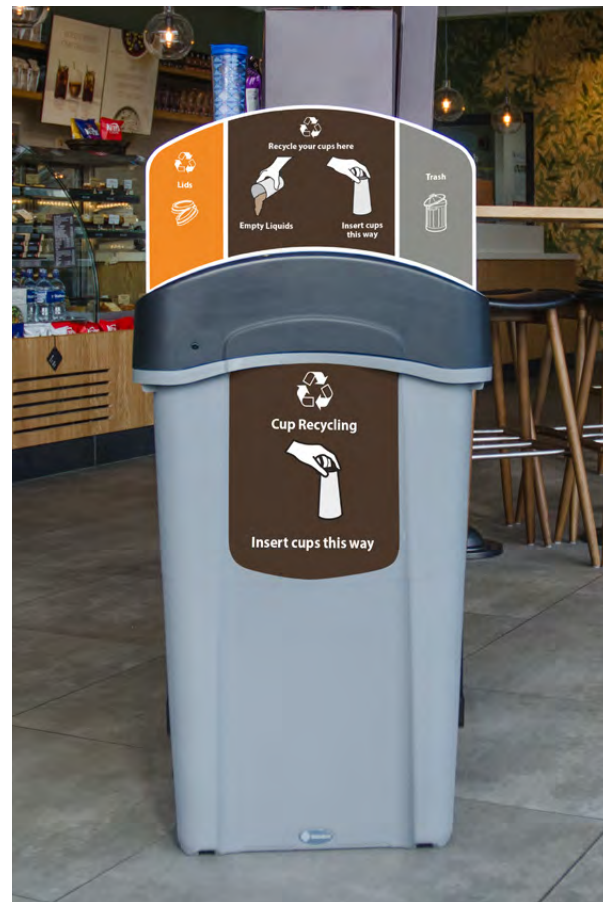
NEW Eco Nexus® Cup Recycling Station