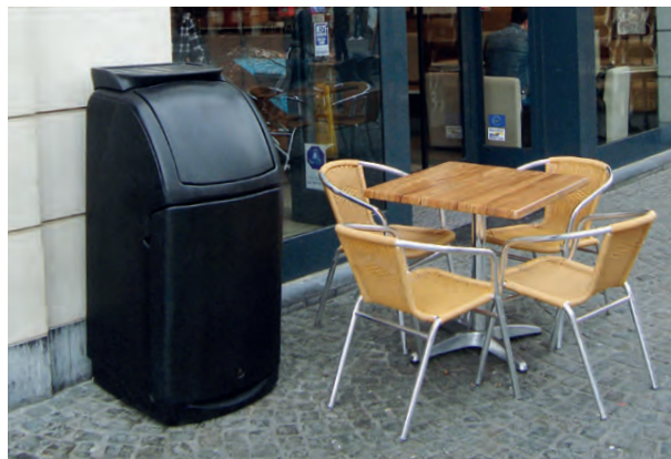
Nexus® 36G Trash Can

Glasdon outdoor trash cans are designed in a choice of sizes, colors and styles, providing waste management solutions that will complement any landscape. Constructed from durable materials, these trash cans are designed to resist the effects of adverse weather conditions, corrosion and vandalism.