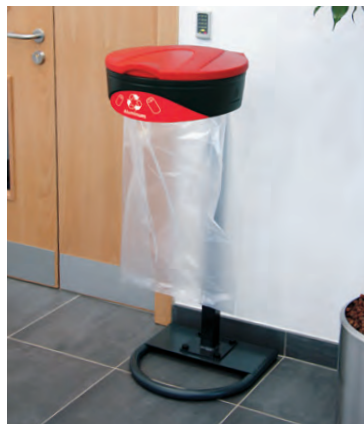
Glasdon Orbit™ Recycling Bag Holder