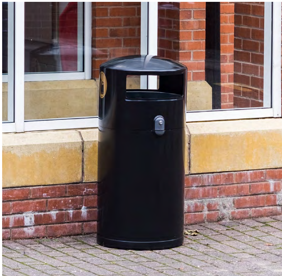
Community™ Trash Can