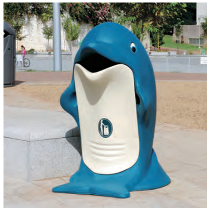
Splash™ Trash Can

An animal-shaped trash can is an ideal solution to help encourage young children to dispose of their trash correctly in both indoor and outdoor environments. The fun and colorful nature of the trash cans means that they are able to complement all areas for children. You can also personalize our animal-shaped trash cans to feature your company logo, color and message.