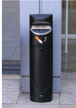
Ashguard SG™ Cigarette Unit