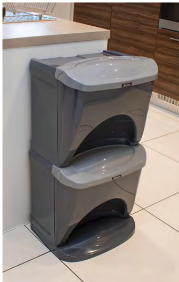
NEW Nexus® Stack 16G Recycling Bin