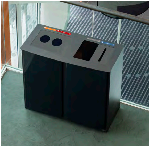
NEW Nexus® Style 48G Quad Recycling Station