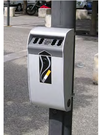
Mini Ashmount™ Cigarette Unit