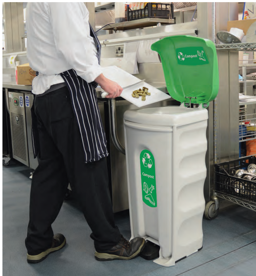
Nexus® Shuttle Food Waste Bin