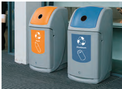
Nexus® 36G Recycling Bin