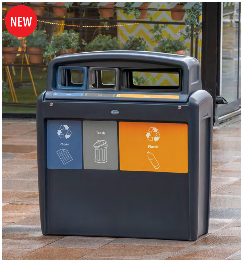
NEW Nexus® Transform City Trio Recycling Station