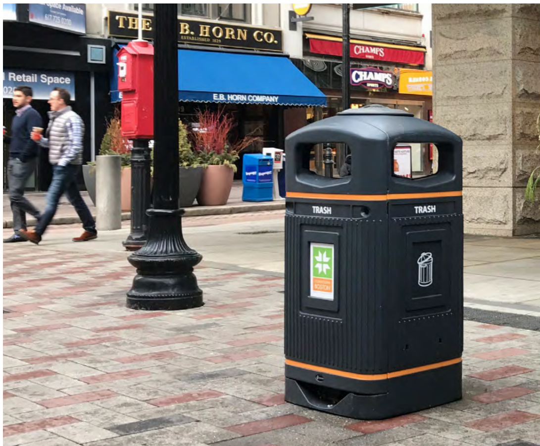
Glasdon Jubilee™ 29G Trash Can with Ashtray Option