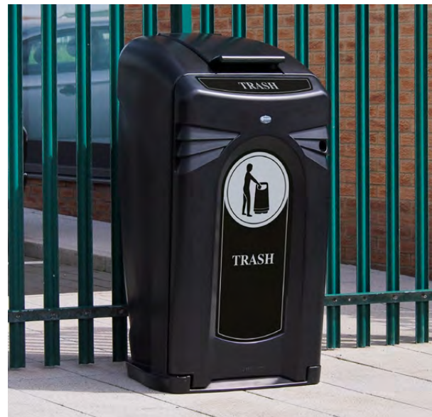
Nexus® City 64G Trash Can