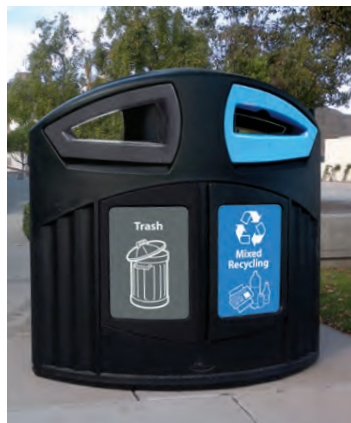
Nexus® 52G Dual Trash Recycling Bin

We supply an extensive range of outdoor recycling containers, ideal for collecting various waste streams in exterior environments. The resilience and durability of our outdoor recycling bins means that they are able to withstand adverse weather conditions as well as being corrosion, rust and chip resistant.