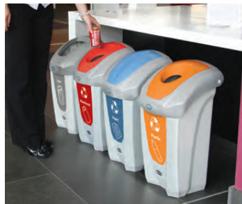
Nexus® 8G Recycling Bin