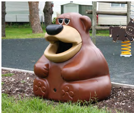
TidyBear™ Trash Can