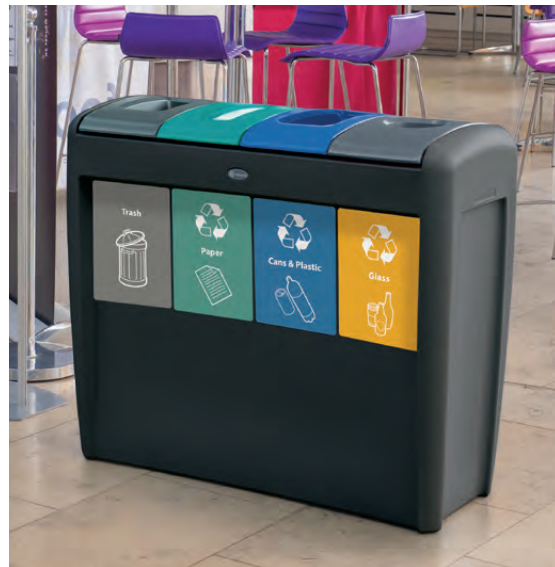
NEW Nexus® Transform Quad Recycling Station