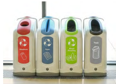
Nexus® 13G Recycling Bin