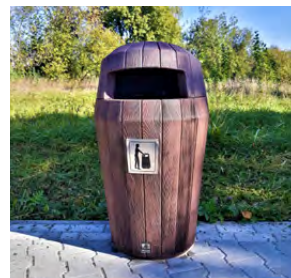
Sherwood™ Trash Can