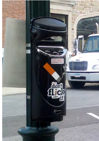
Ashmount SG™ Cigarette Unit