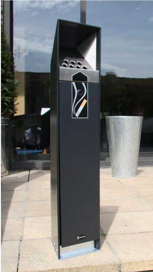
Ashguard™ Cigarette Unit

Glasdon design and produce a range of cigarette units that can be situated in outdoor smoking areas, outside buildings, parks and sidewalks. Within our range of cigarette waste containers there are units that can be wall mounted as well as free standing. Having a cigarette unit mounted to a wall takes up very little space making it perfect for narrow footed areas. Help to reduce the cost of cleaning up cigarette butt litter for your organization by installing a cigarette ash receptacle.