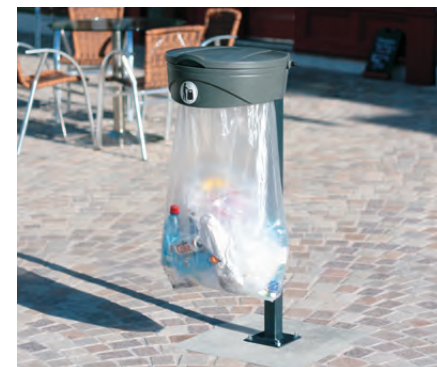
Glasdon Orbit™ Trash Bag Holder