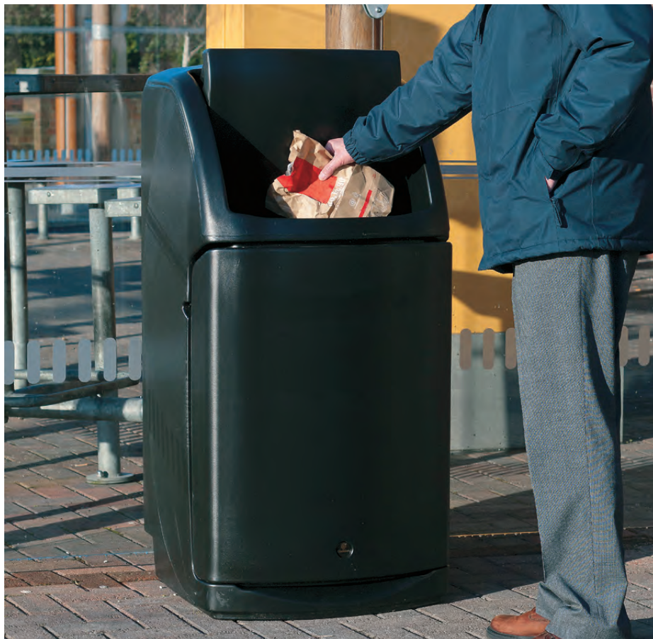
Nexus® 36G Trash Can