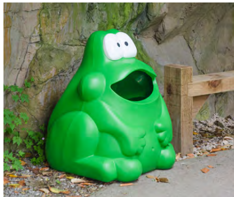
Froggo™ Trash Can