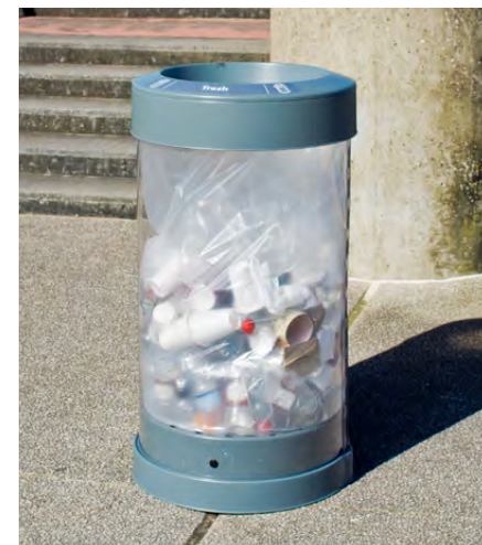
C-Thru™ 50G Trash Can