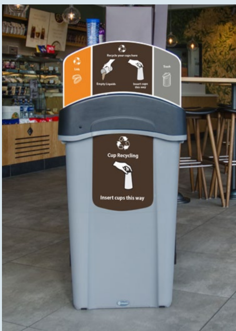
Eco Nexus® Cup Recycling Station