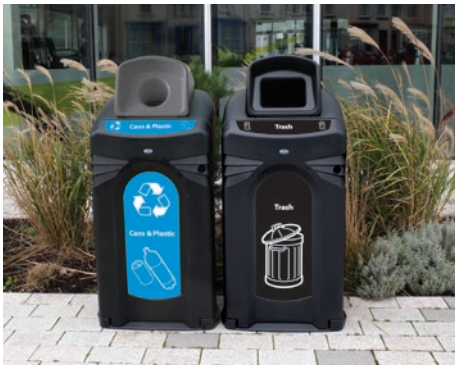
Nexus® City 64G Recycling Bin