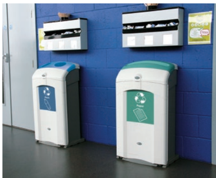
Nexus® 26G Recycling Bin