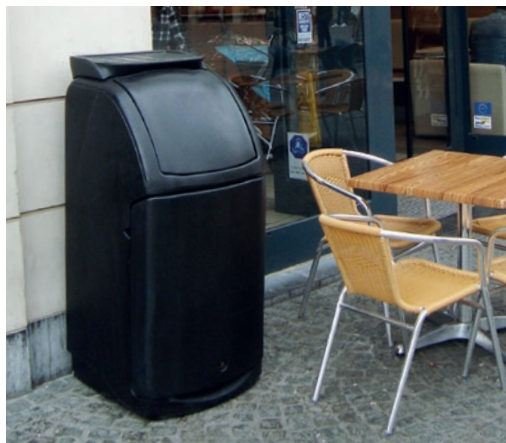
Nexus® 36G Trash Can

Our purposely designed food waste receptacles are ideal for any areas where food is prepared or consumed. The easy to use foot pedals, tray holders and large apertures make food waste disposal effortless and hygienic.