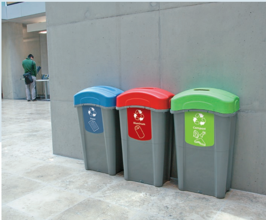
Eco Nexus® 23G Recycling Bin

We design and manufacture a wide range of indoor recycling bins. Our recycling containers are available in a large selection of styles, materials and capacities to suit your requirements. Apertures and decals are available for various waste streams, which allow you to manage recycling waste more effectively.