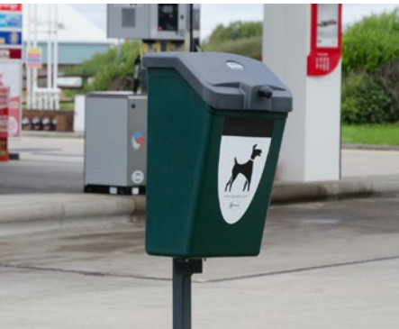
Fido™ Pet Waste Station