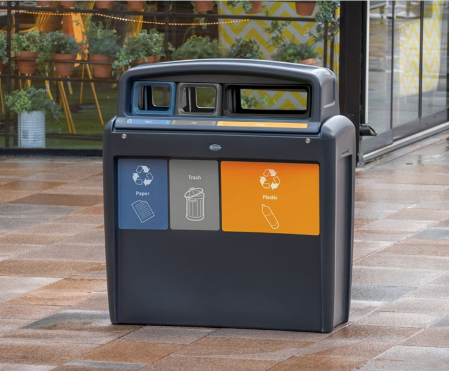
Nexus® Transform City Trio Recycling Station

We produce an extensive range of outdoor recycling containers of the highest quality in both traditional and contemporary designs. All of our recycling containers are designed to be hard-wearing and long-lasting and feature easily identifiable decals to make recycling easy.