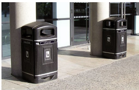
Glasdon Jubilee™ 29G Trash Can