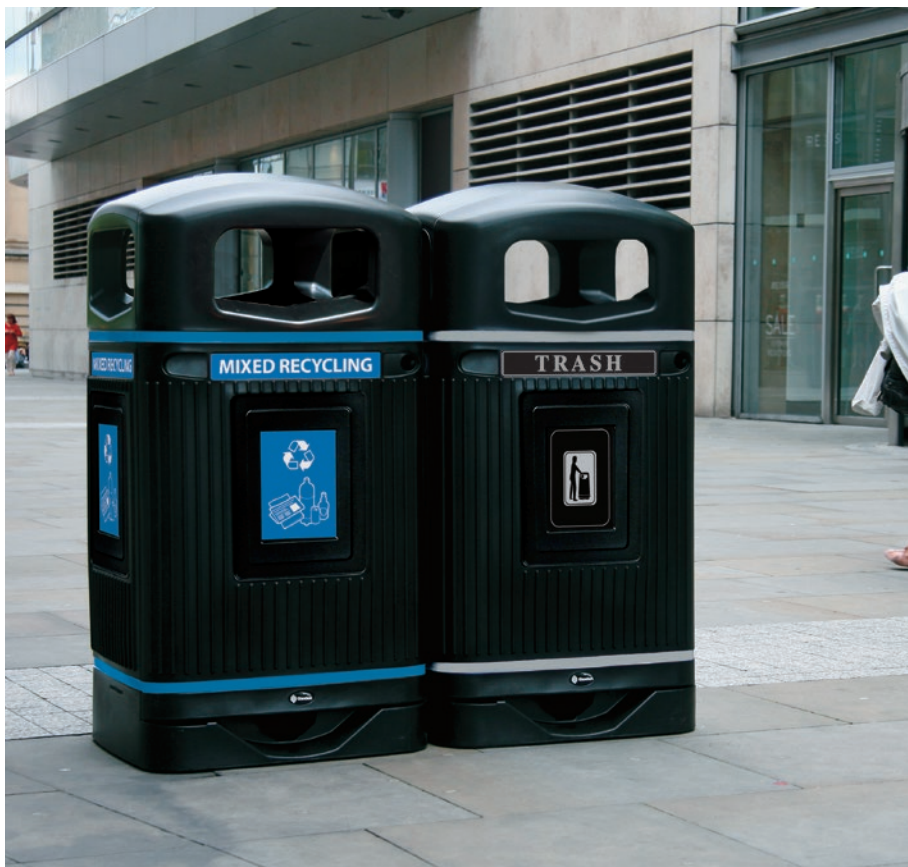
Glasdon Jubilee™ 29G Recycling Bin