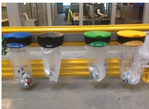
Glasdon Orbit™ Recycling Bag Holder