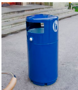
Community™ Trash Can