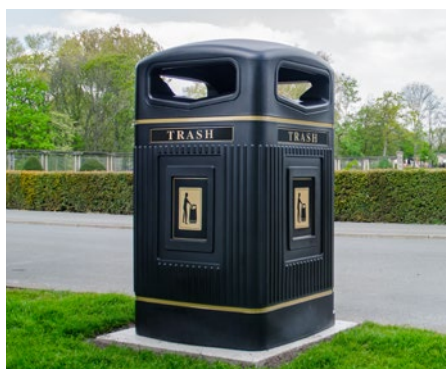
Glasdon Jubilee™ 80G Trash Can