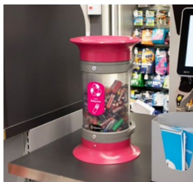
C-Thru™ 5Q Recycling Bin