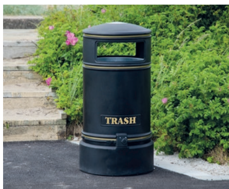
Topsy Jubilee™ Trash Can