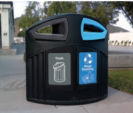
Nexus® 52G Dual Trash Recycling Bin