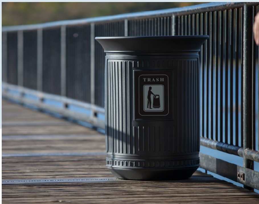
Canyon™ Trash Can

Glasdon outdoor trash cans are designed in a choice of sizes, colors and styles, providing waste management solutions that will complement any landscape. Constructed from durable materials, these trash cans are low-maintenance, and designed to resist the effects of adverse weather conditions, corrosion and vandalism.