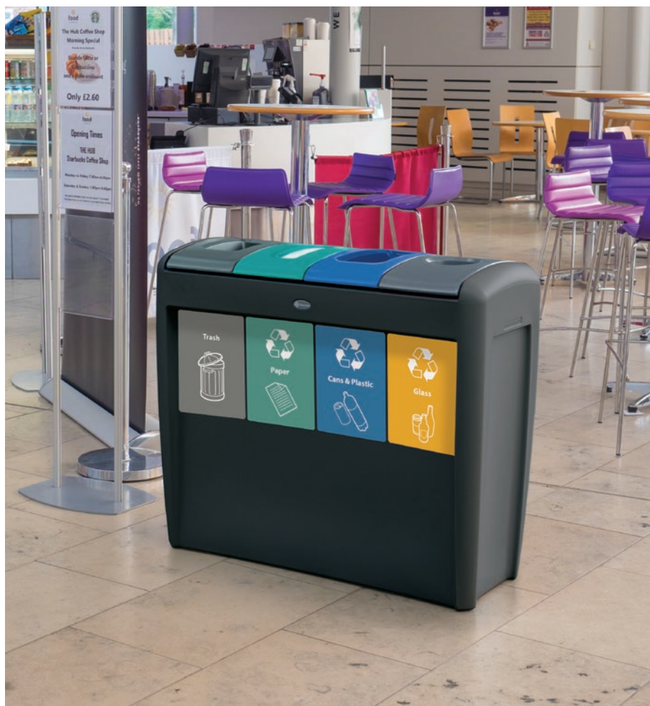
Nexus® Transform Quad Recycling Station