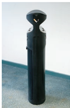
Ashguard SG™ Cigarette Unit