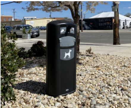
Retriever City™ Pet Waste Station