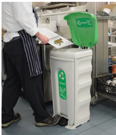
Nexus® Shuttle Food Waste Bin