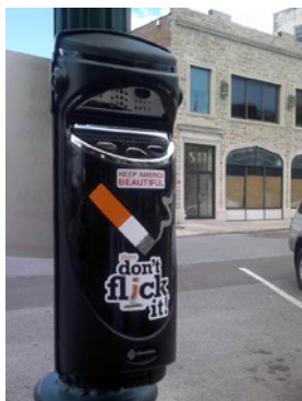
Ashmount SG™ Cigarette Unit