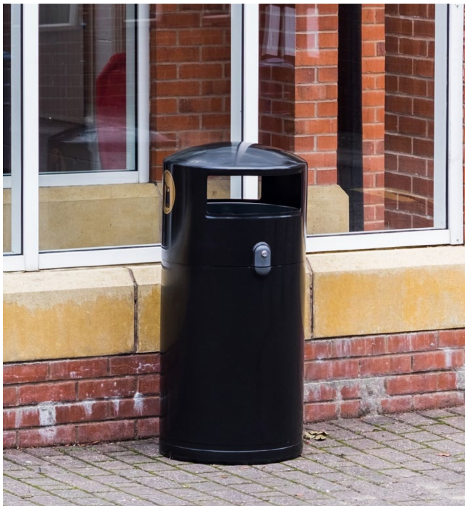
Community™ Trash Can