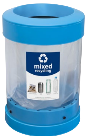
C-Thru™ 36G Recycling Bin