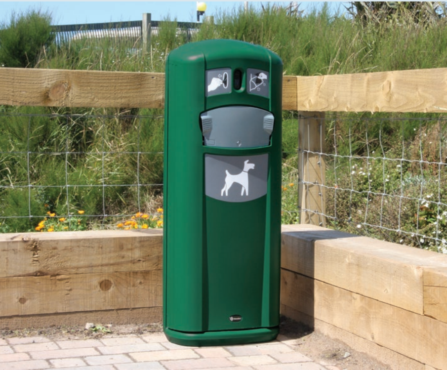
Retriever City™ Pet Waste Station

Enable visitors traveling with their pets to clean up after their four-legged companions by siting pet waste stations at your gas station. Post-mounted or ground-fixed receptacles come complete with closed lids and chute systems to contain odours