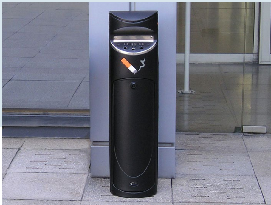
Ashguard SG™ Cigarette Unit

Glasdon designs and produces a range of cigarette units which can be situated in outdoor smoking areas, outside buildings, and on sidewalks. Within our range of cigarette waste containers, there are units that can be wall mounted as well as free standing. Having a cigarette unit mounted to a wall takes up very little space, making it perfect for narrow-footed areas. Help to reduce the cost of cleaning up cigarette butt litter for your organization by installing a cigarette ash receptacle.