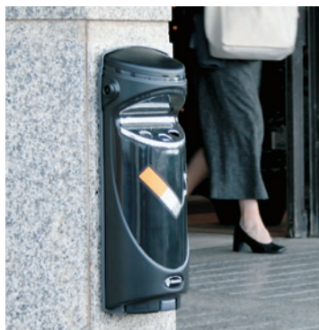
Ashmount SG™ Cigarette Unit