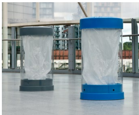
C-Thru™ 50G Recycling Bin