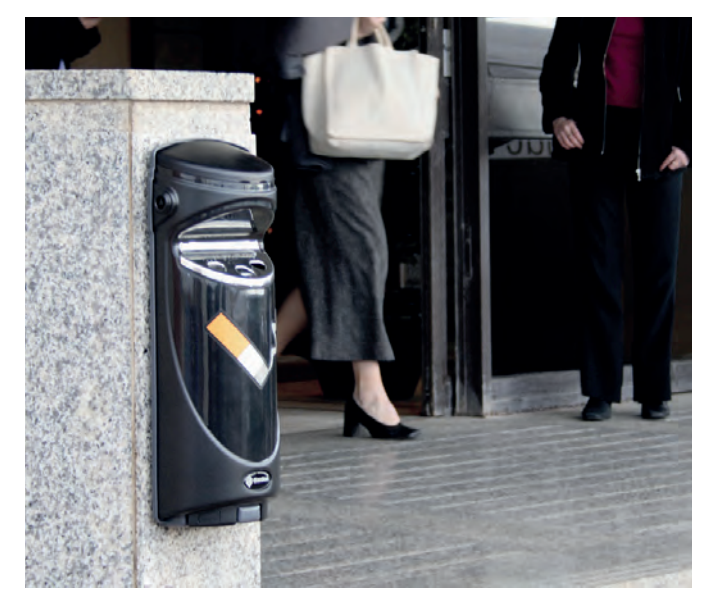
Ashmount SG™ Cigarette Unit