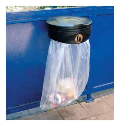
Glasdon Orbit<sup>™</sup> Bag Holder