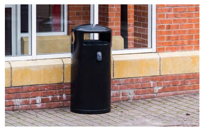
Community<sup>™</sup> Trash Can