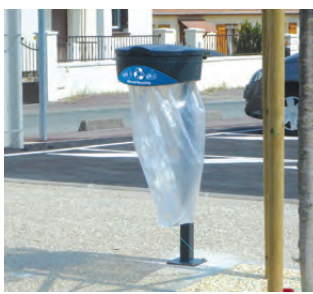
Glasdon Orbit™ Recycling Bag Holder