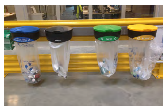
Glasdon Orbit™ Recycling Bag Holder