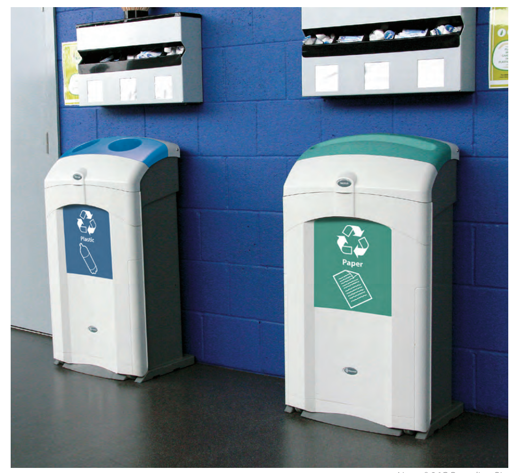
Nexus® 26G Recycling Bin

Our indoor recycling bins are available in a variety of styles, streams and capacities to make creating a recycling station as easy as possible. Many of our customers choose to personalize their products with their logo, colors and slogans. We can even customize your recycling bins to create bespoke waste streams to suit your recycling program.