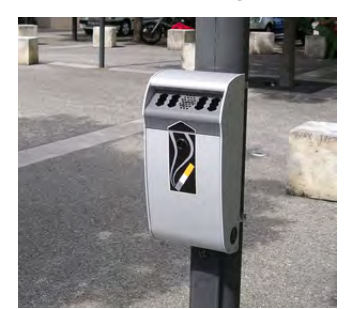
Mini Ashmount™ Cigarette Unit