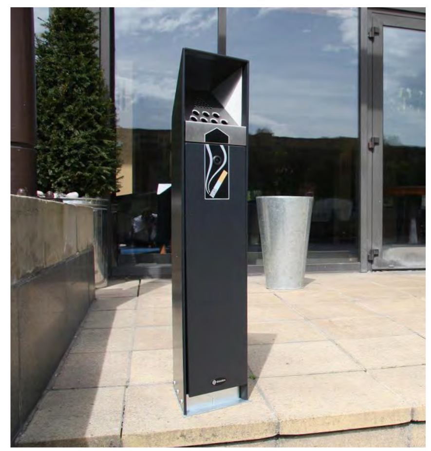
Ashguard™ Cigarette Unit