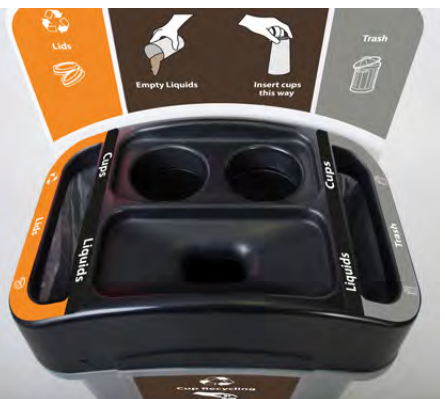
NEW Eco Nexus® Cup Recycling Station