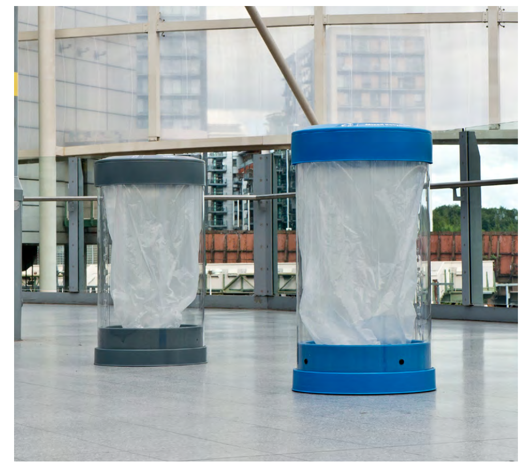
C-Thru<sup>™</sup> 50G Recycling Bin