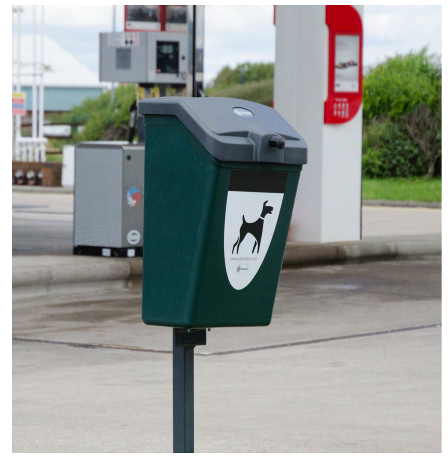
Fido™ Pet Waste Station