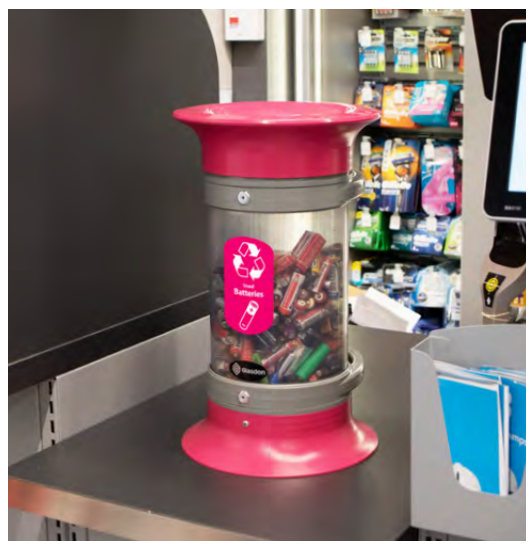
C-Thru™ 5Q Recycling Bin