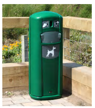
Retriever City<sup>™</sup> Pet Waste Station