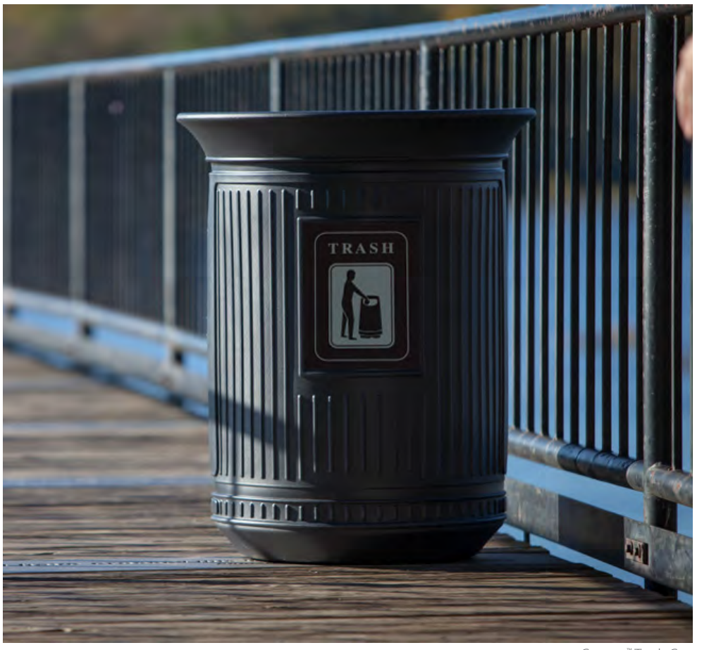
Canyon<sup>™</sup> Trash Can

The Glasdon range of outdoor trash cans are designed in a choice of sizes, colors and styles, providing waste management solutions that will complement any external location. Constructed from durable materials, these trash cans include low-maintenance plastic trash cans designed to resist the effects of adverse weather conditions, corrosion and vandalism.