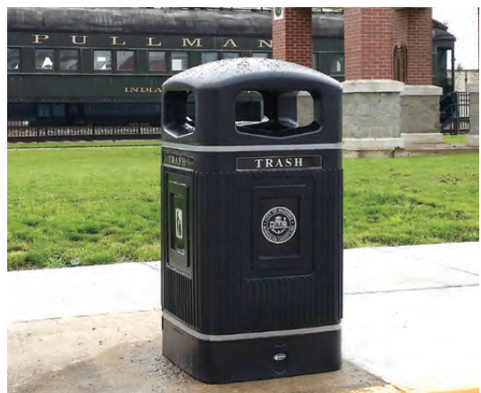
Glasdon Jubilee™ 29G Trash Can