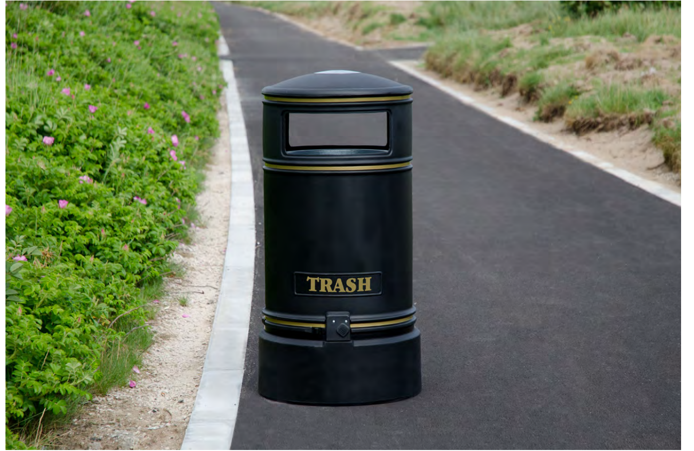
Topsy Jubilee<sup>™</sup> Trash Can