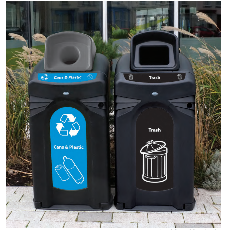
Nexus® City 64G Recycling Bin