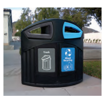
Nexus® 52G Dual Trash Recycling Bin

We supply an extensive range of outdoor recycling containers, ideal for collecting various waste streams in exterior environments. The resilience and durability of our outdoor recycling bins means that they are able to withstand adverse weather conditions as well as being corrosion, rust and chip resistant.