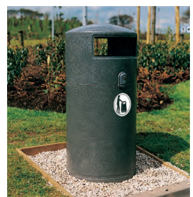
Community<sup>™</sup> Trash Can