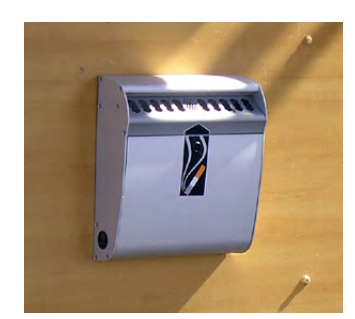
Ashmount<sup>™</sup> Cigarette Unit