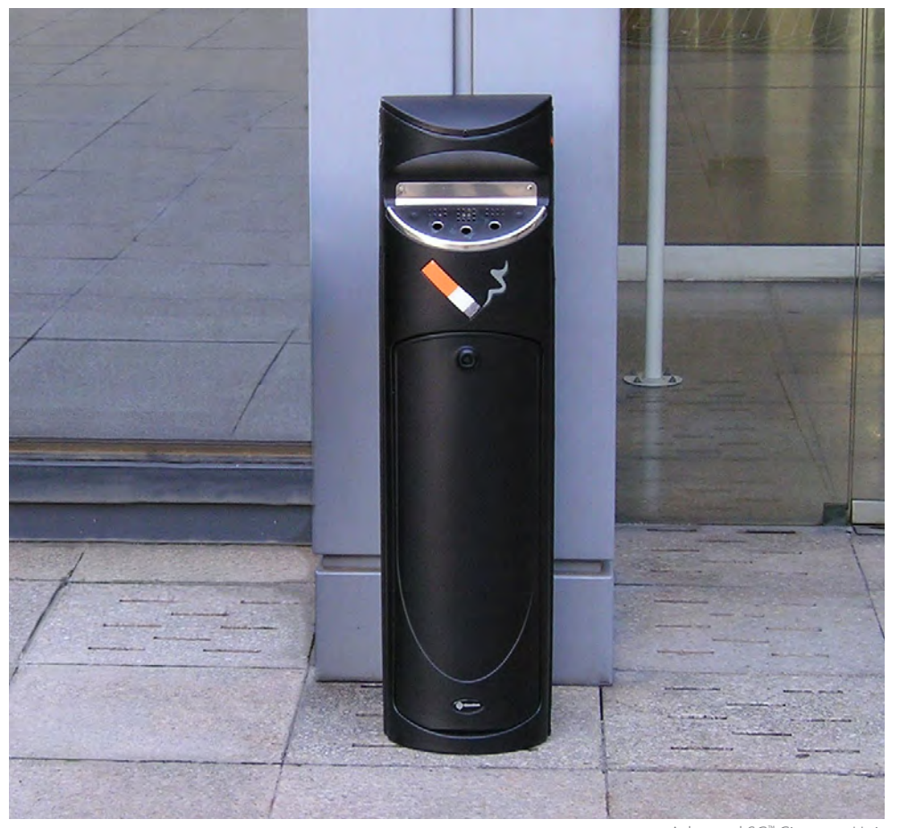
Ashquard SG<sup>™</sup> Cigarette Unit