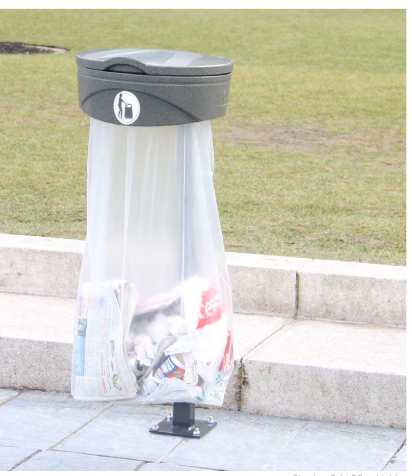
Glasdon Orbit™ Bag Holder