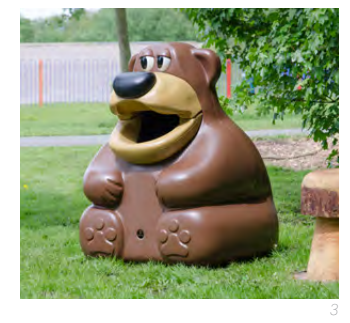
Splash<sup>™</sup> Trash Can Froggo<sup>™</sup> Trash Can TidyBear<sup>™</sup> Trash Can