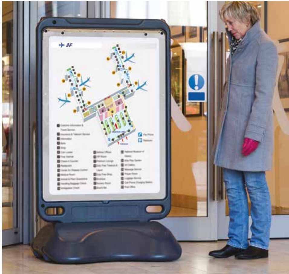
1. Advocate Sidewalk Sign