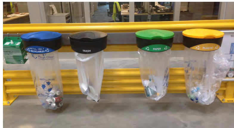
Glasdon Orbit™ Recycling Bag Holder