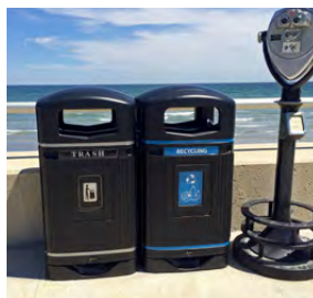
Glasdon Jubilee™ 29G Trash and Recycling Combo