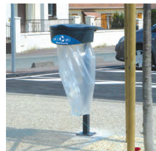
Glasdon Orbit™ Recycling Bag Holder