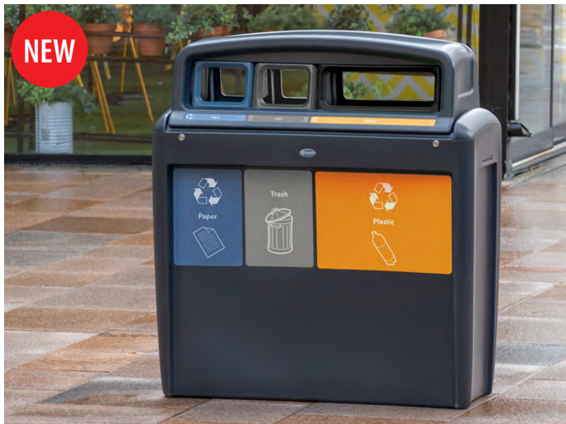
NEW Nexus® Transform City Trio Recycling Station

We produce an extensive range of outdoor recycling containers of the highest quality, in both traditional and contemporary designs. All of our recycling containers are designed to be hard-wearing and long-lasting and feature easily identifiable decals to make recycling easy.