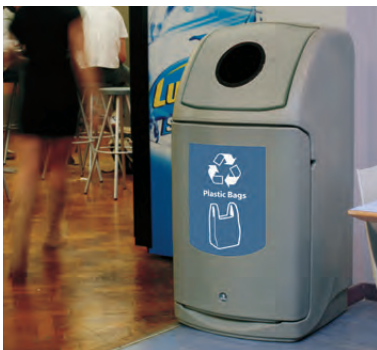
Nexus® 36G Recycling Bin