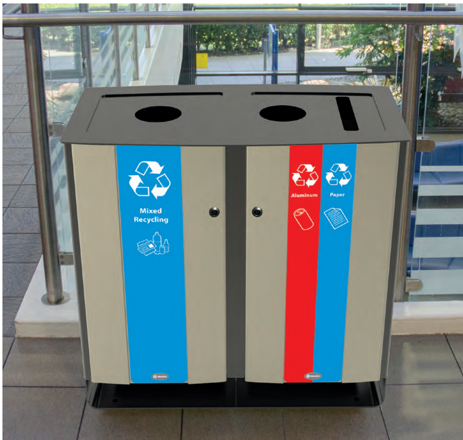
NEW Electra™ 48G Trio Recycling Station