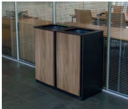
NEW Nexus® Style 48G Duo Recycling Station