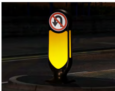
Signmaster Ultra™ Bollard