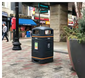
Glasdon Jubilee™ 29G Trash Can