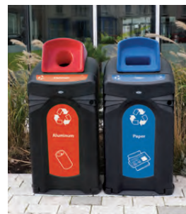
Nexus® City 64G Recycling Bin