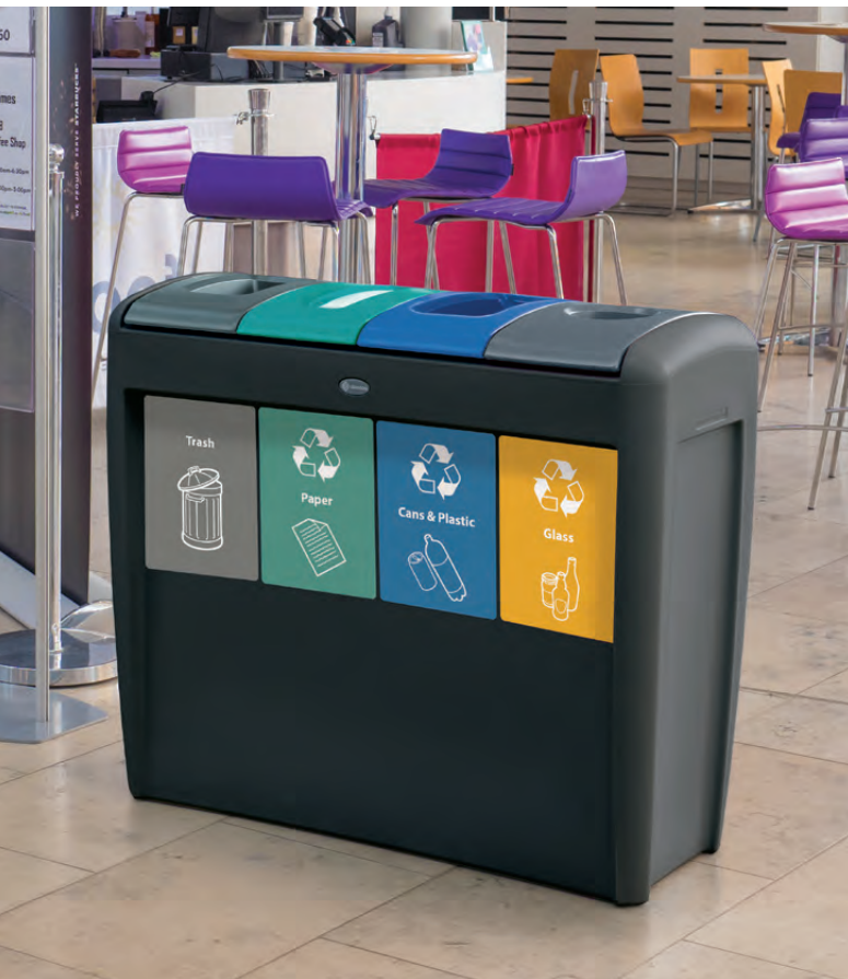
NEW Nexus® Transform 26G Quad Recycling Bin