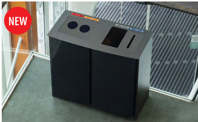
NEW Nexus® Style 48G Quad Recycling Station