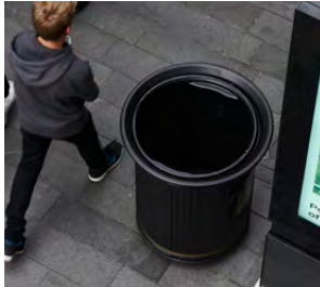
Canyon Trash Can