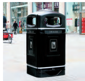
Glasdon Jubilee™ 29G Trash Can with Ashtray Option