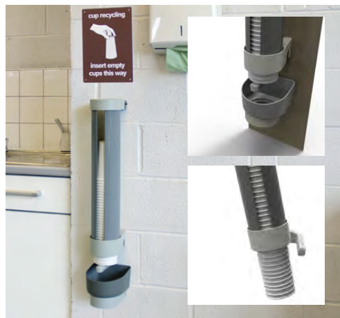
NEW Nexus® Cup Stacker