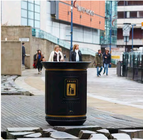
Canyon Trash Can