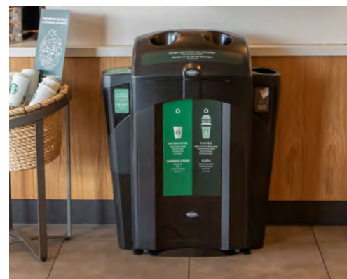
NEW Nexus® 26G Duo Recycling Station