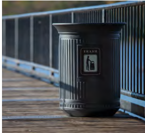
Canyon Trash Can