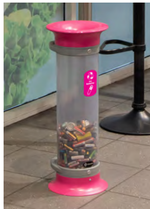
C-Thru™ 10Q Battery Recycling Bin