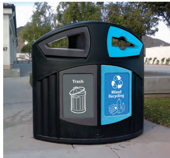
Nexus® 52G Dual Trash Recycling Bin