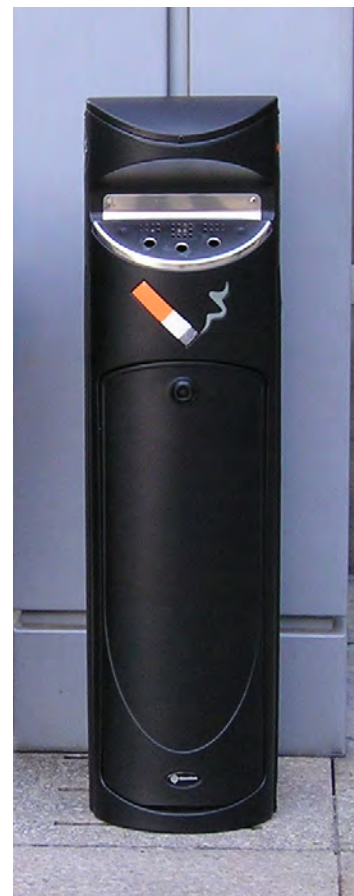
Ashguard SG™ Cigarette Unit