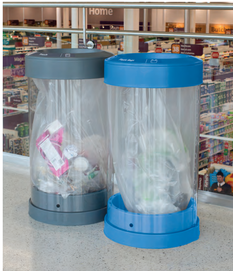
C-Thru™ 50G Recycling Bin