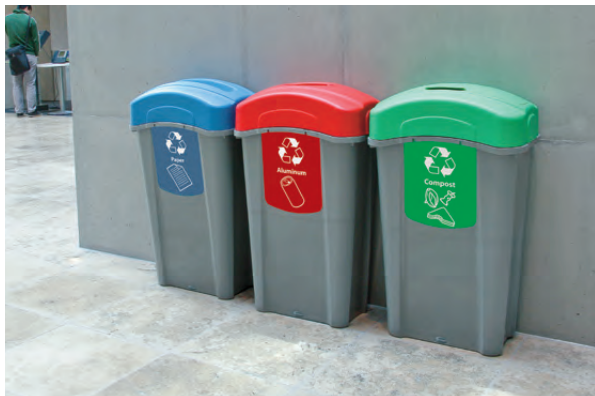
Eco Nexus® 23G Recycling Bin

Our indoor recycling bins are available in a variety of styles, streams and capacities to make creating a recycling station as easy as possible. Many of our customers choose to personalize their products with their logo, colors and slogans. We can even customize your recycling bins to create bespoke waste streams to suit your recycling program.