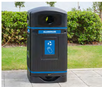
Glasdon Jubilee™ 29G Recycling Bin