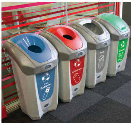
Nexus® 8G Battery Recycling Bin

Help to recover the valuable materials found within batteries and improve waste diversion rates with Glasdon battery recycling containers.