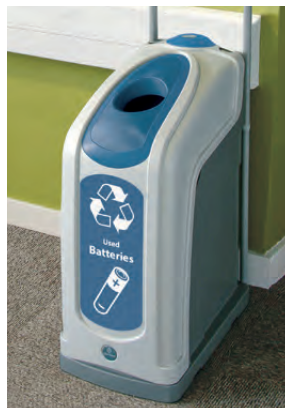
Nexus® 13G Battery Recycling Bin