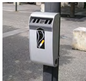
Mini Ashmount™ Cigarette Unit