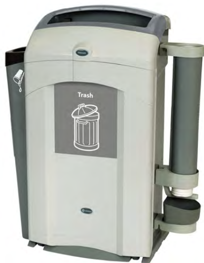
NEW Nexus® 26G Recycling Station

Increase disposable cup recycling rates with cup recycling bins and stations by Glasdon. We offer dedicated and multi-purpose paper and plastic cup recycling bins, designed to help you implement an effective and efficient cup recycling program.