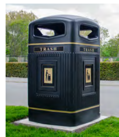
Glasdon Jubilee™ 80G Trash Can