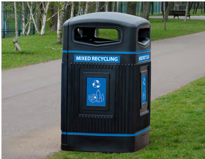
Glasdon Jubilee™ 80G Recycling Bin