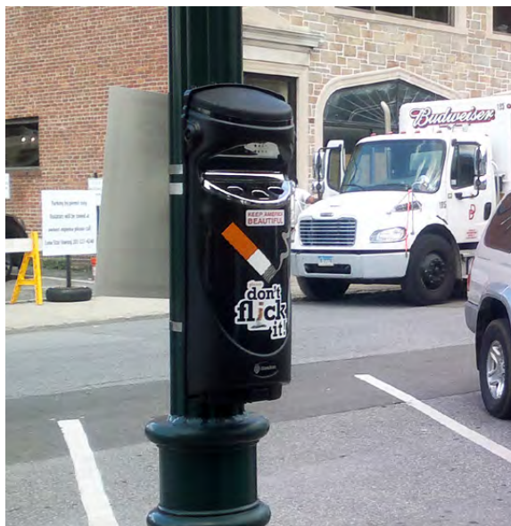
Ashmount SG™ Cigarette Unit

Glasdon design and produce a range of cigarette units that can be situated in outdoor smoking areas, outside buildings, parks and sidewalks. Within our range of cigarette waste containers, there are units that can be wall mounted as well as free standing. Having a cigarette unit mounted to a wall takes up very little space making it perfect for narrow footed areas. Help to reduce the cost of cleaning up cigarette butt litter for your organization by installing a cigarette ash receptacle.