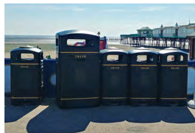
Glasdon Jubilee™ 29G and 80G Trash Can