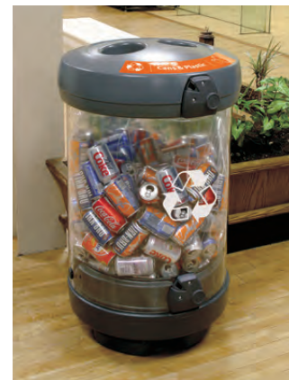
C-Thru™ 48G Recycling Bin