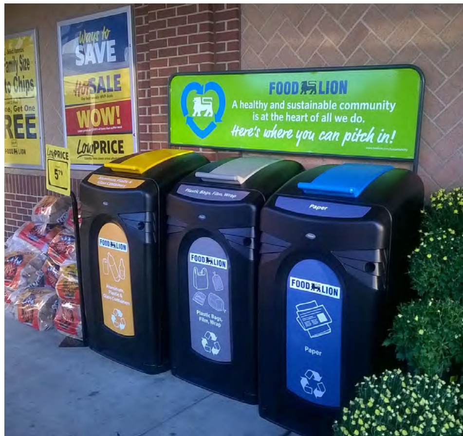
Nexus® City 64G Recycling Bin