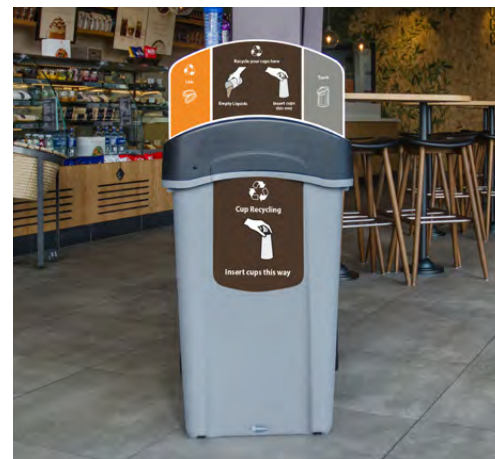
NEW Eco Nexus® Cup Recycling Station