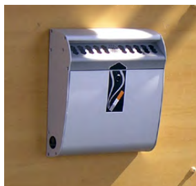
Ashmount™ Cigarette Unit