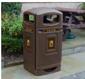
Glasdon Jubilee™ 29G Trash Can