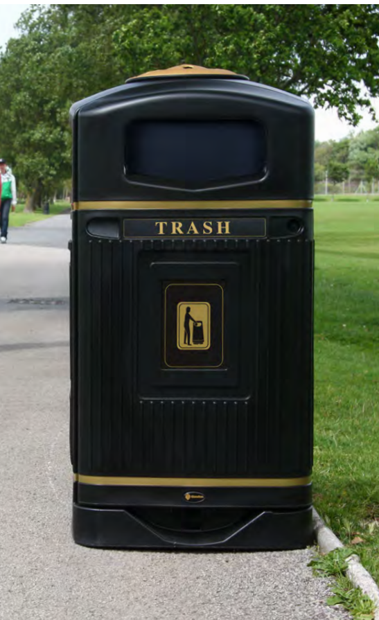
Glasdon Jubilee™ 29G Trash Can