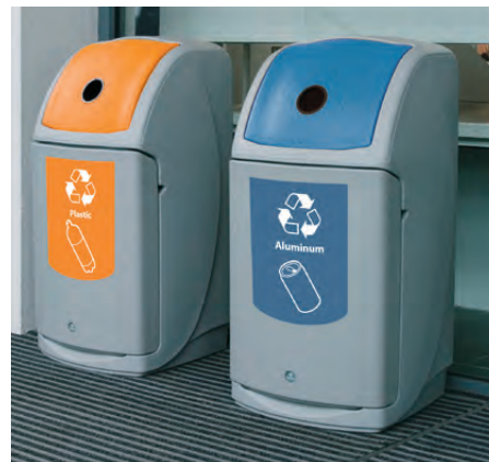
Nexus® 36G Recycling Bin