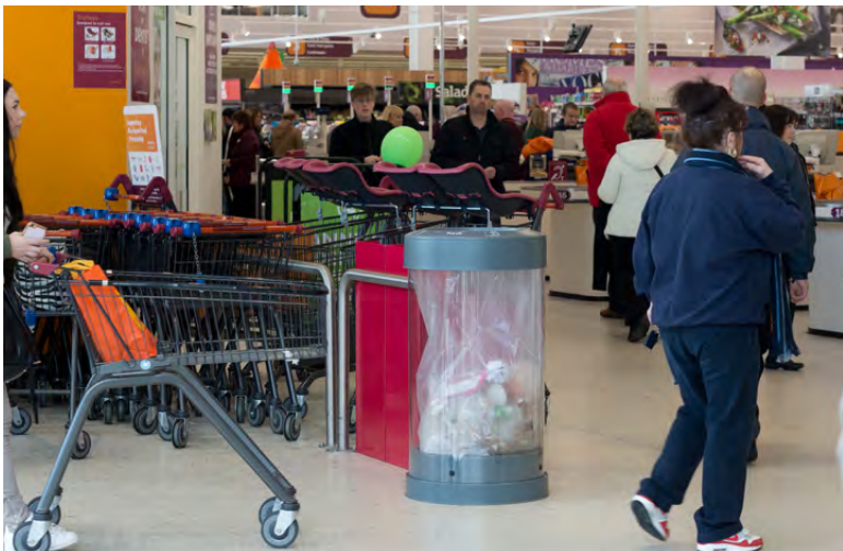
C-Thru™ 50G Recycling Bin