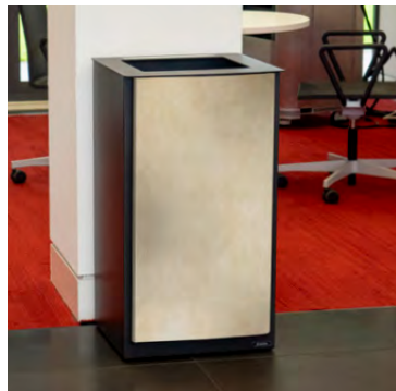
NEW Nexus® Style 24G Recycling Station