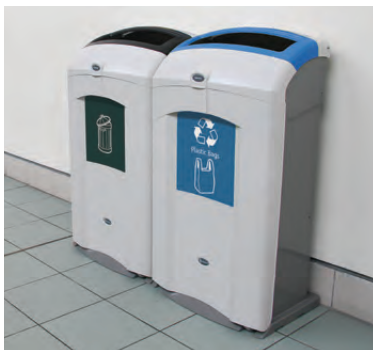
Nexus® 26G Recycling Bin