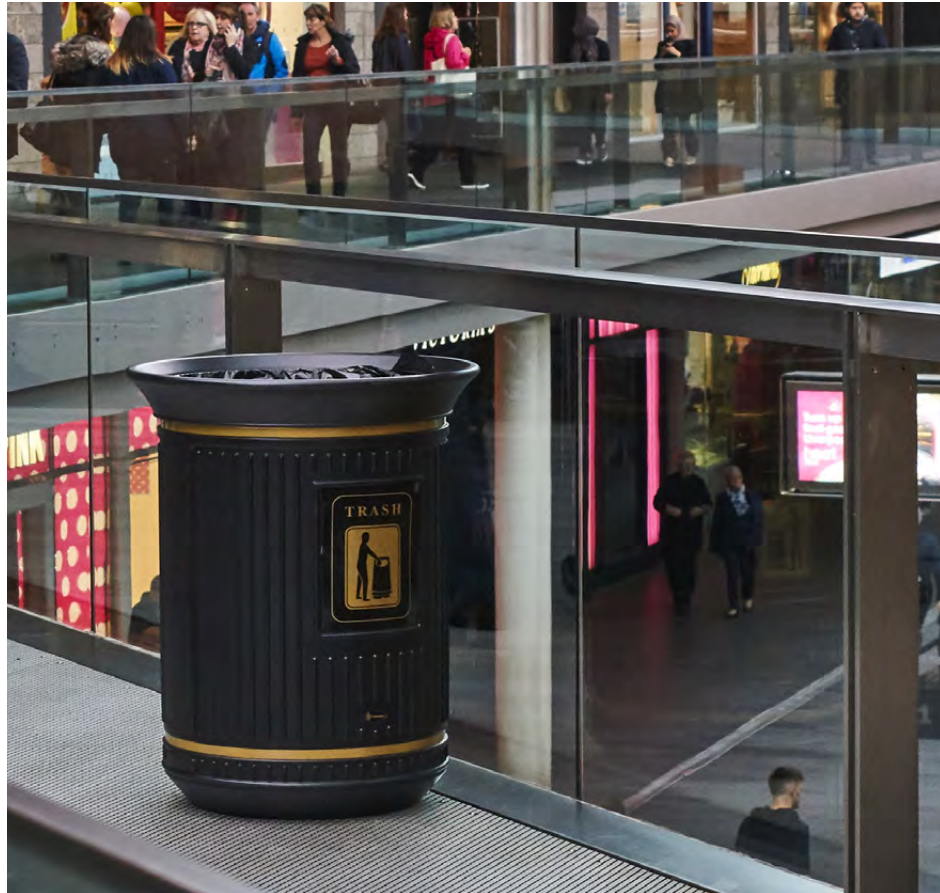
Canyon™ Trash Can