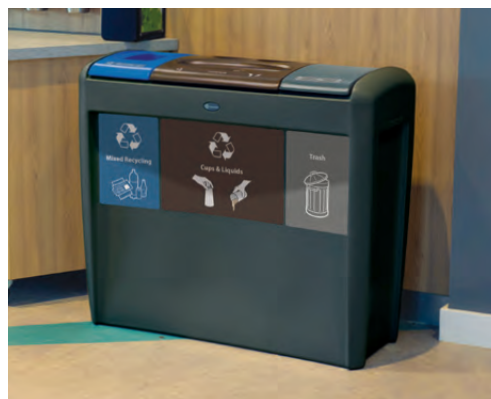
NEW Nexus® Transform Cup Recycling Station