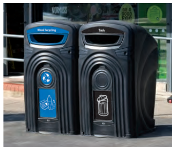
Nexus® 96G Recycling Bin