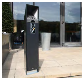
Ashguard™ Cigarette Unit