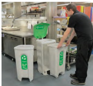
1. Nexus® Shuttle Food Waste Bin