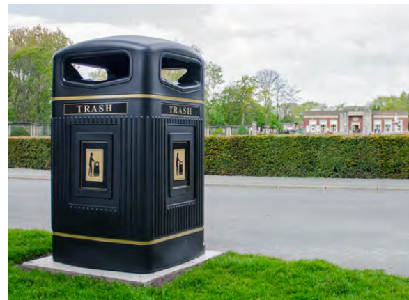
Glasdon Jubilee™ 80G Trash Can