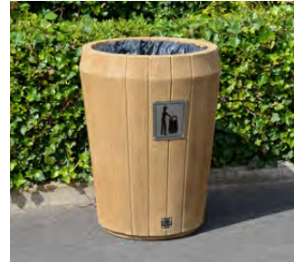
Sherwood™ Open Top Trash Can