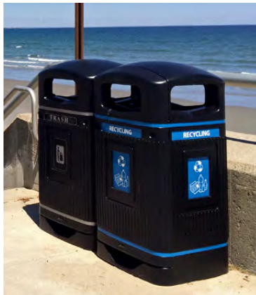
Glasdon Jubilee™ 29G Trash and Recycling Combo