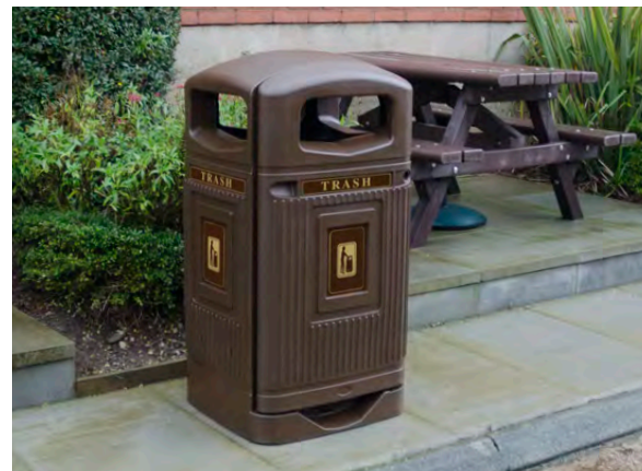
Glasdon Jubilee™ 29G Trash Can