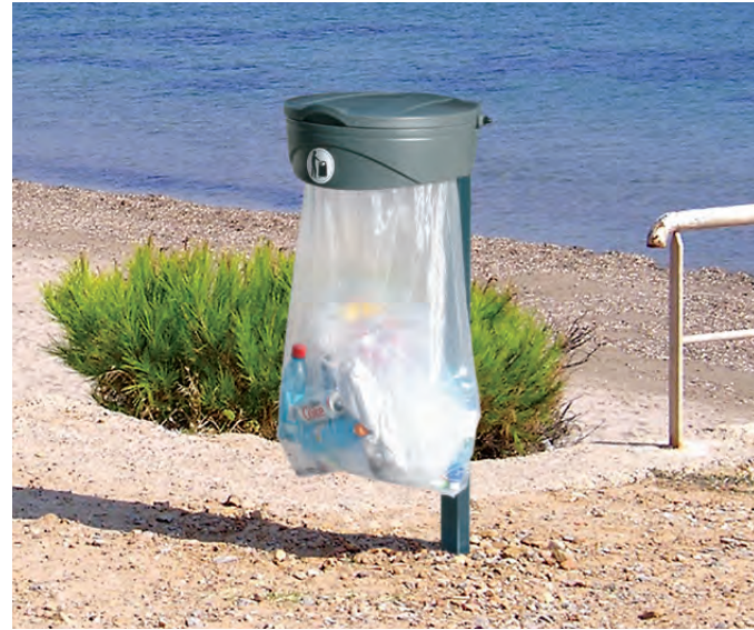
Glasdon Orbit™ Bag Holder