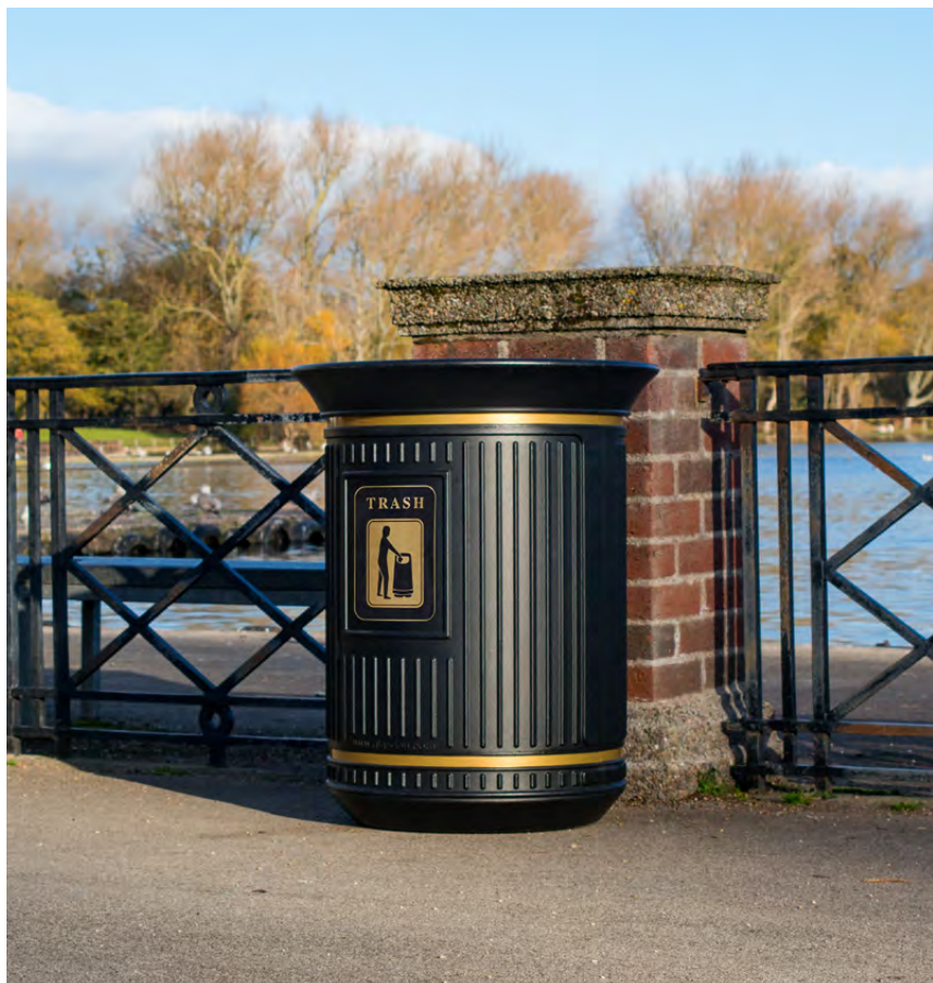
Canyon™ Trash Can