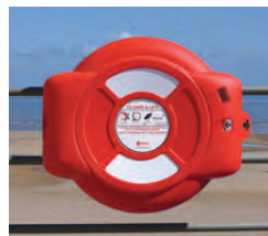
Guardian rail mounted