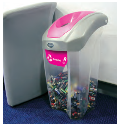
C-Thru Nexus® 8G Battery Recycling Bin