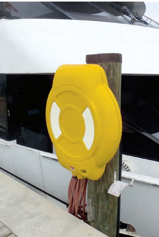
Guardian 24" in Yellow on an existing pole