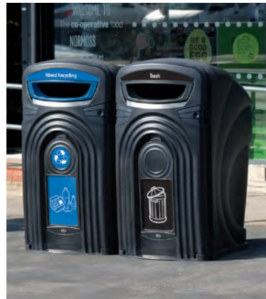
Nexus® 96G Recycling Bin