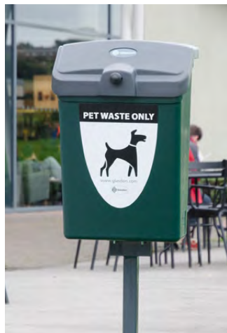
Fido™ Pet Waste Station

Our selection of pet waste stations are popular for use in parks, on sidewalks and in bark parks. The clear decals help to encourage people to dispose of their dog poop correctly and the contemporary design of our dog waste units means that they complement existing landscapes easily.