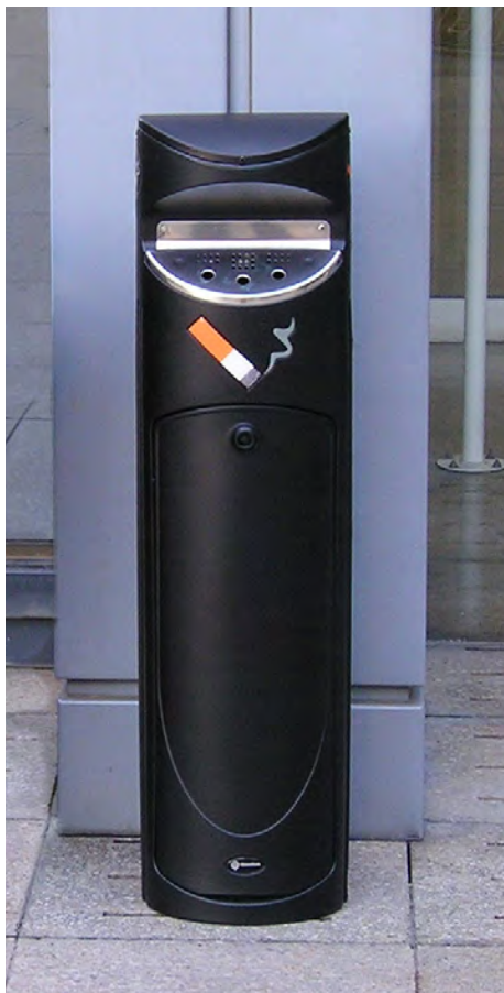
Ashguard SG™ Cigarette Unit