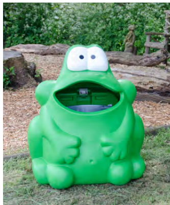
Froggo™ Trash Can

You can also personalize our animal shaped trash cans to feature your company logo, color and message.