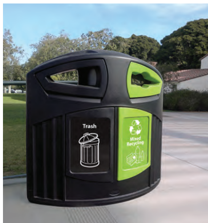
Nexus® 52G Dual Trash Recycling Bin

We produce an extensive range of outdoor recycling containers of the highest quality, in both traditional and contemporary designs. All of our recycling containers are designed to be hard-wearing and long-lasting and feature easily identifiable decals to make recycling easy.