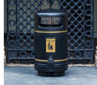
Topsy Royale™ Trash Can