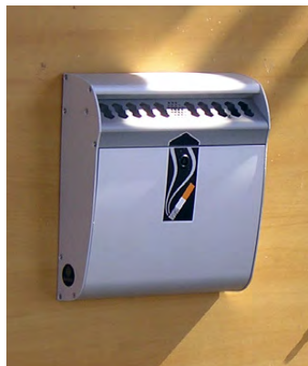
Ashmount™ Cigarette Unit