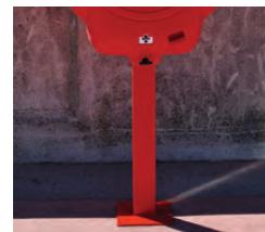
Guardian pole mounted