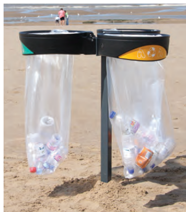
Glasdon Orbit™ Bag Holder