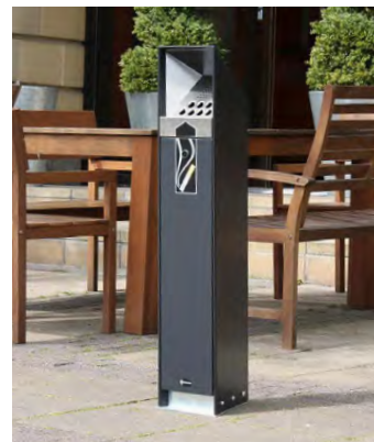
Ashguard™ Cigarette Unit