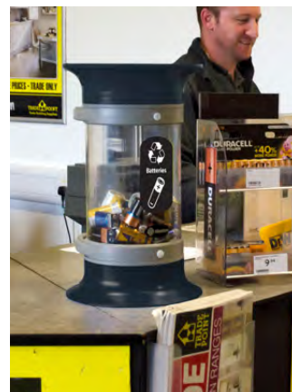
C-Thru™ 5Q Battery Recycling Bin