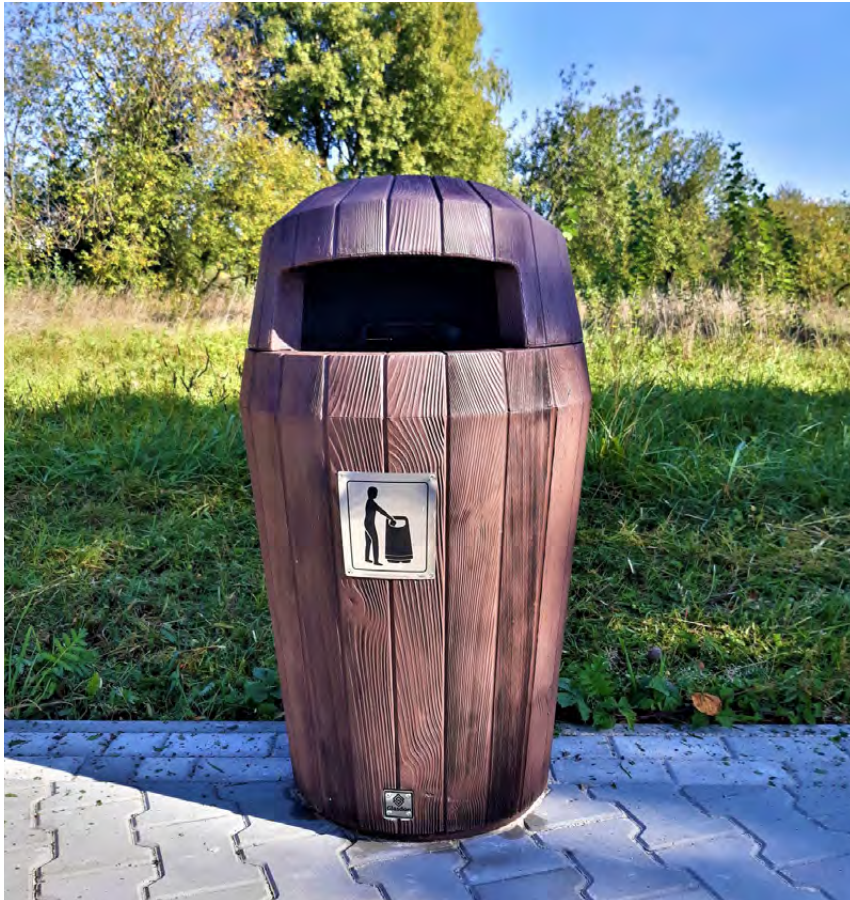
Sherwood™ Hooded Trash Can