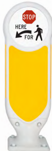
Signmaster Ultra Bollard