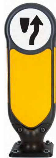
Signmaster™ Ultra Bollard