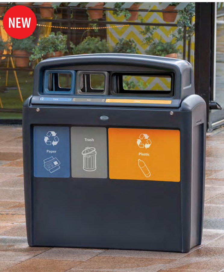
NEW Nexus® Transform City Recycling Station