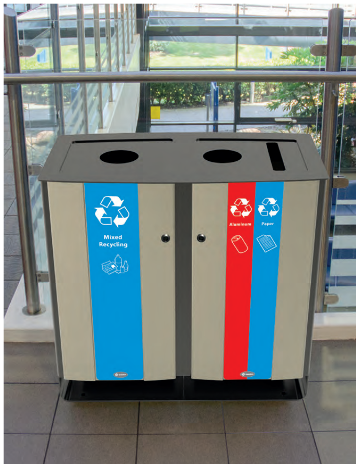
NEW Electra™ 48G Trio Recycling Station