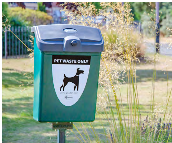
Fido Pet Waste Station