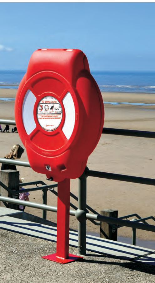
Guardian™ 30" Pole Mounted