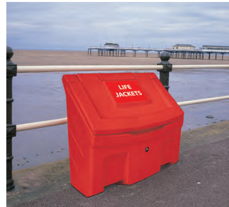
NEW Slimline™ 42G Life Jacket Storage Box