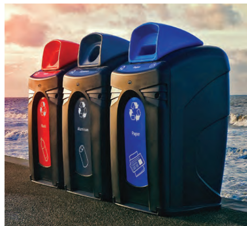
Nexus® City 64G Recycling Bin