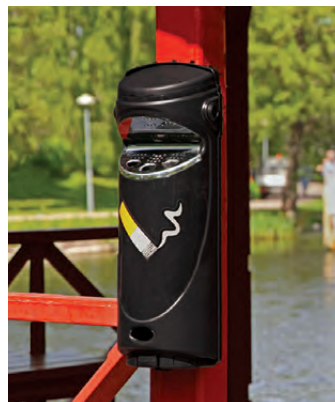
Ashmount SG™ Cigarette Unit