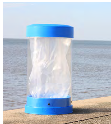
C-Thru™ 50G Recycling Bin