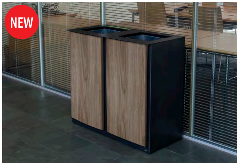
NEW Nexus® Style 48G Duo Recycling Station