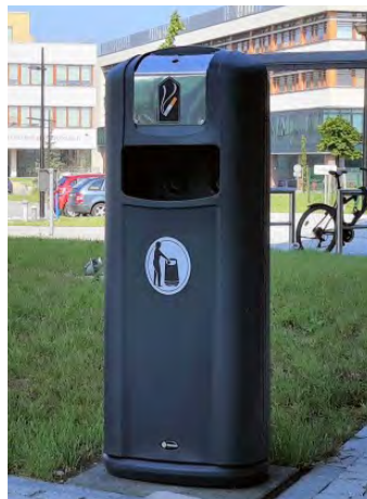
Integro City™ Ash/Trash Can