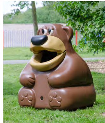
TidyBear™ Trash Can