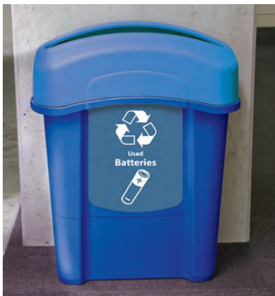
Eco Nexus® 16G Battery Recycling Bin