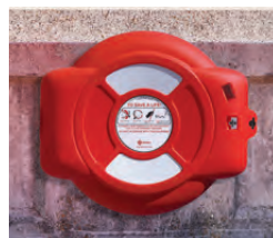
Guardian wall mounted