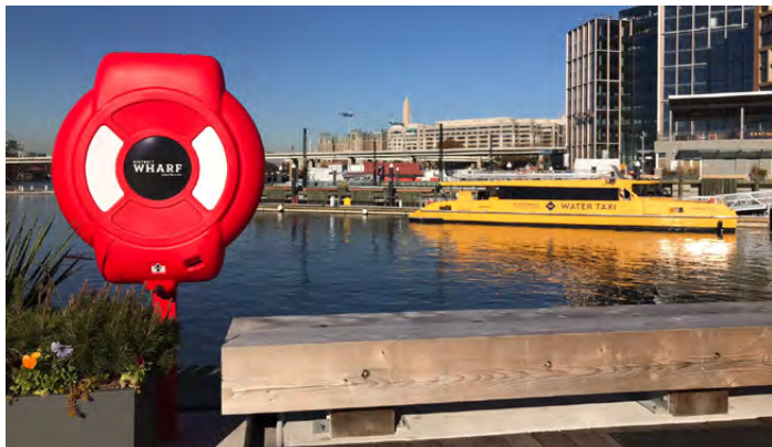
Guardian™ 30" Pole Mounted with Personalisation

Help keep your environment safe and well-protected, with water safety equipment from Glasdon. Highly visible and resilient for a long service life, Glasdon ring buoy stations prevent theft or vandalism and are easy to position in any area where open water poses a danger. Our versatile life jacket boxes are designed and constructed with aesthetics, practicality and durability in mind to keep your vital life-saving equipment well protected.