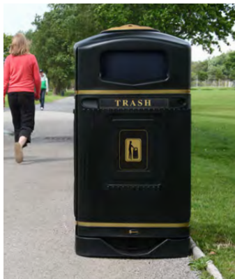
Glasdon Jubilee™ 29G Trash Can