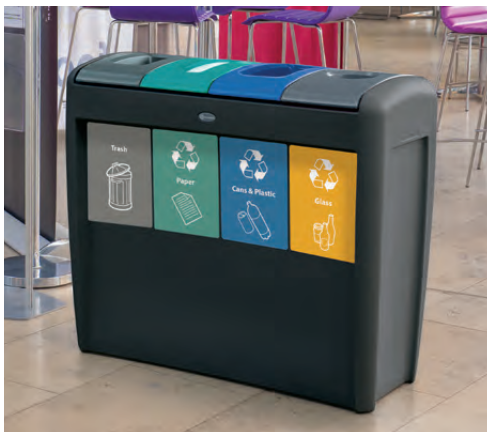
NEW Nexus® Transform Recycling Station