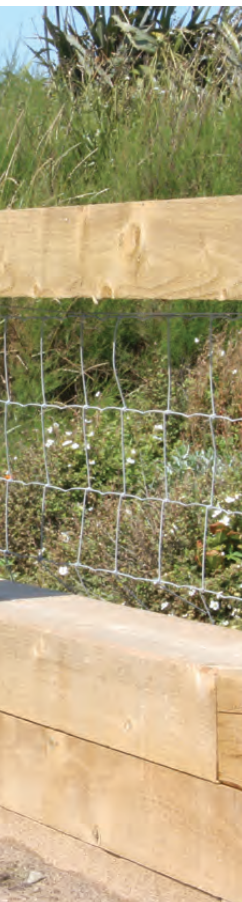
Retriever City™ Pet Waste Station