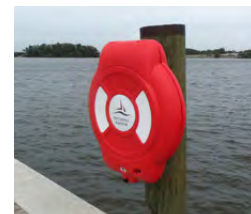
Guardian on an existing pole