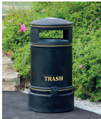
Topsy Jubilee™ Trash Can

The Glasdon range of outdoor trash cans are designed in a choice of sizes, colors and styles, providing waste management solutions that will complement any external location. Constructed from durable materials, these trash cans include low-maintenance plastic trash cans and robust metal trash containers, designed to resist the effects of adverse weather conditions, corrosion and vandalism.