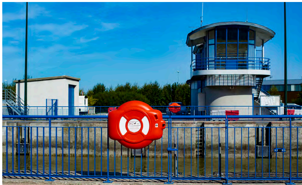
Guardian™ 24" rail mounted