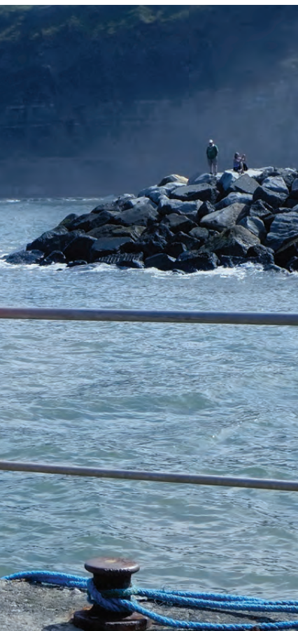
Guardian 30" Pole Mounted