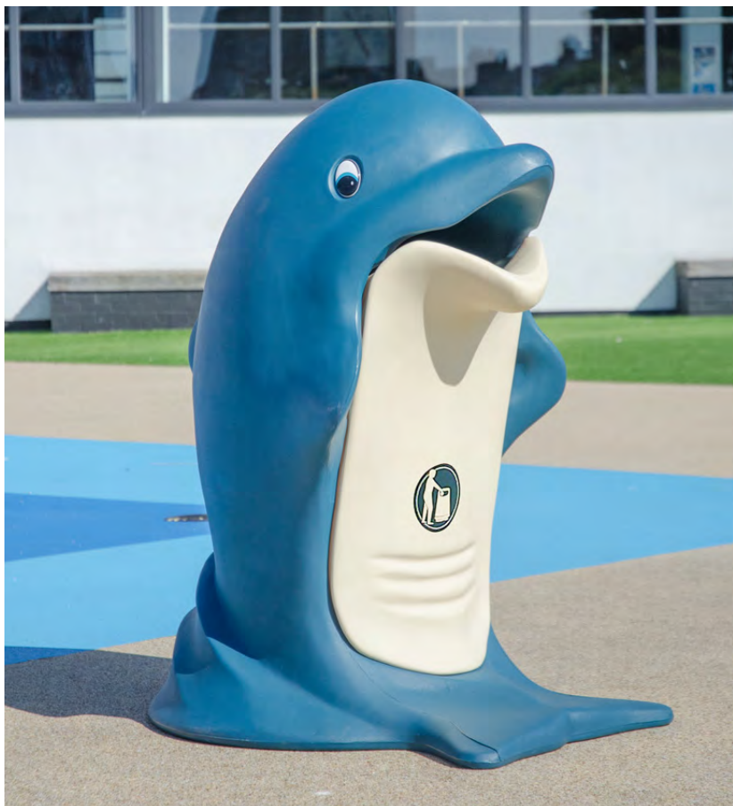
Splash™ Trash Can