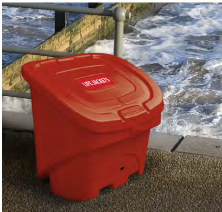
NEW Nestor™ 106G Life Jacket Storage Box