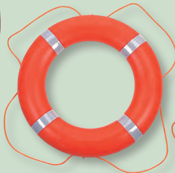
24" USCG Approved Life Ring with 100' Rope

USCG Type IV approved, Glasdon life rings are an ideal buoyancy aid for use around any location where there is a drop to the water. The life rings are available in a 24" or 30" size and can be stored in the protective Guardian life ring cabinets.