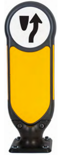
Signmaster™ Ultra Bollard