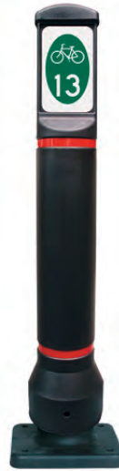
Neopolitan Signhead™ Bollard

The Glasdon range of street bollards are the ideal solution for traffic calming schemes, sidewalks, bikeways, parking lots and other road safety applications. From flexible, impact-absorbing bollards to sign-carrying marker posts, these bollards are designed to withstand extreme weather conditions, offering a low maintenance road safety solution.